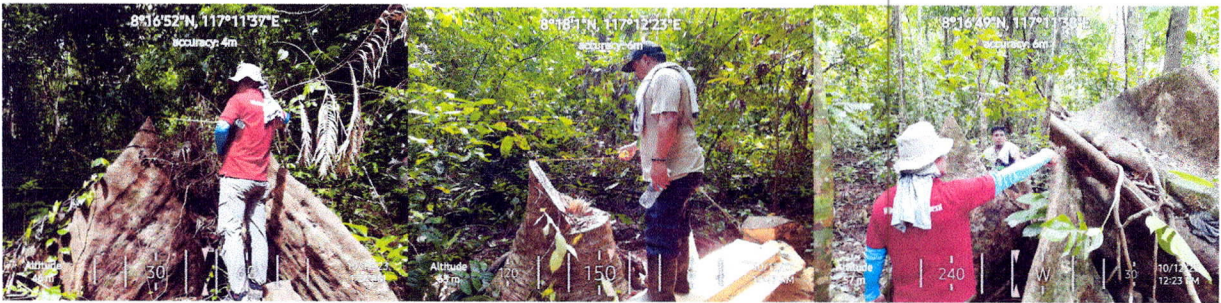
Figure 3: During the patrol, the team documented a total of 16 illegally cut trees.