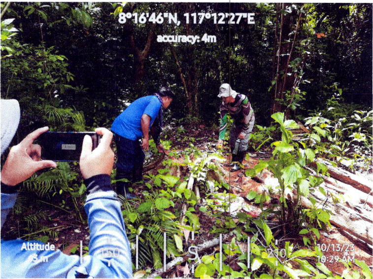
Figure 2. Documentation of threats (cutting of tree)

Methods: The patrol was conducted on foot within the conservation areas of the Island Barangay. Patrollers used the Cybertracker app to accurately document their observations, encompassing data related to forest conditions, potential threats, and wildlife (refer to Figure 2). These patrols were closely coordinated with the relevant Barangay authorities. The Philippine Cockatoo counting was performed manually.