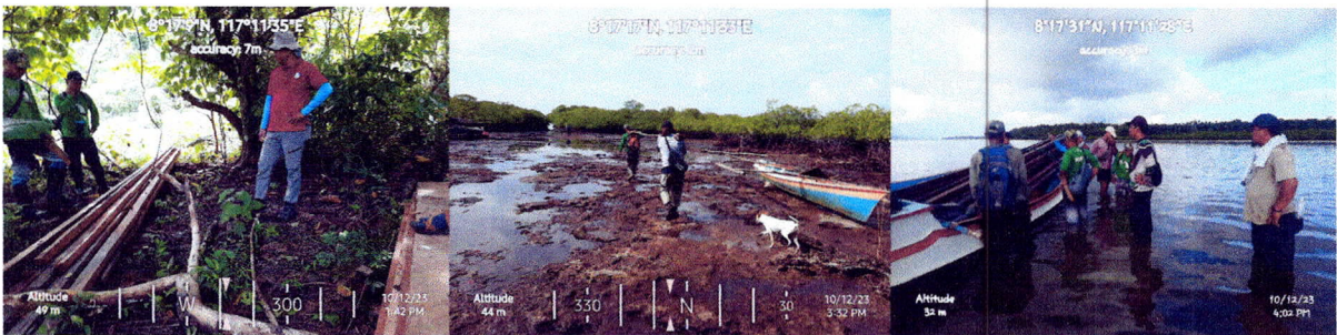
Figure 4. Documented and deposited temporarily in the Barangay compound of Pandanan.