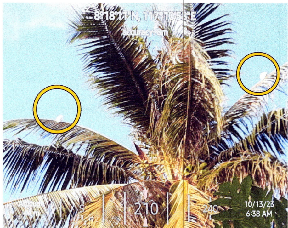
There are cockatoos freely flying around some houses on the island.

One of the daily routines of KFI personnel involves the meticulous tracking of Phil. cockatoo populations, aiming to discern a year-long trend . During the initial involvement of the DENR team in the cockatoo census on June 2, 2023, we meticulously recorded 80 individuals. During our most recent visit to the island on October 12 and 13, 2023, the DENR team took part in the census, revealing a count of 50 individuals in the afternoon and an impressive 131 individuals the following morning. The presence of the cockatoos in residential areas on the island is also quite noticeable (as depicted in Figure 1).