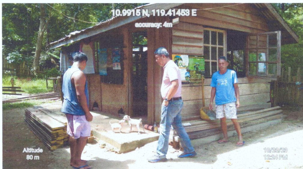
Field visit at FPMS II, Bgy. Bagong-bayan, El Nido, Palawan