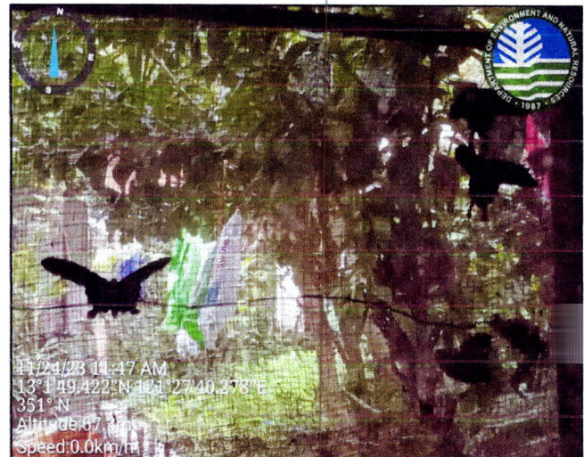
Figures 1 and 2 : Photos of Pink rose butterfly or Pachliopta kotzebuena (taken during inspection)