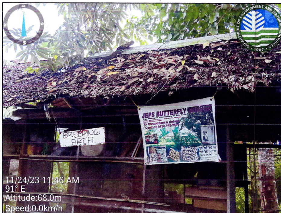
Figure 5. Photo showing the breeding area of JEPS Butterfly farm (recommended for renovation)

Monitoring of the JEPS Butterfly Farm Maningcol, Pinamalayan, Oriental Mindoro November 24, 2023