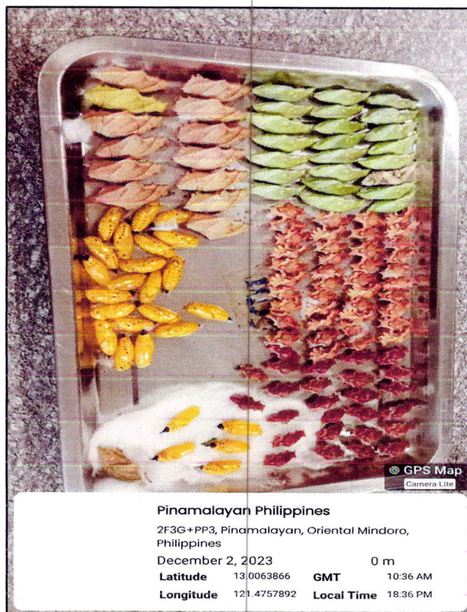
Figure 8 Pupae of Troides rhadamantus , Pachliopta kotzebuea , Papilio rumanzuvia and Idea leucono (total of 130 pcs.) – with Local Transport Permit no. 2023-06