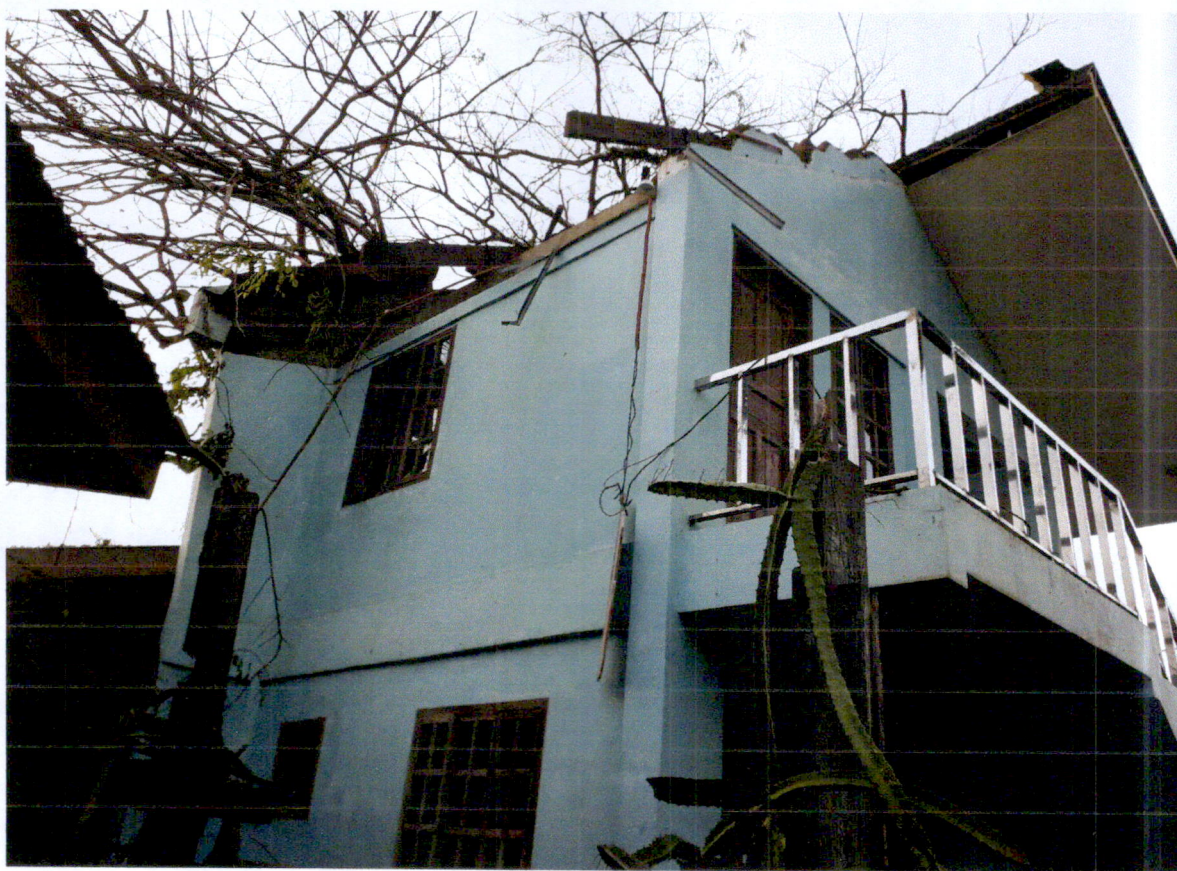
Half of the roof of MSPLS Visitor Center in Sitio Montevista, Bgy. Poblacion, Taytay, Palawan