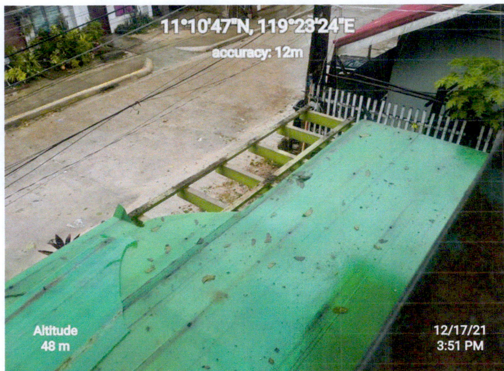
Partially damaged polycarbonate roof of the PAMO-ENTMRPA located along Calle Real, Bgy. Masagana, El Nido, Palawan