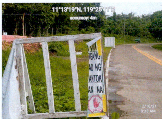
Partially damaged roof, fence and torn signage of FPMS II located in Bgy. Bagong Bayan, El Nido, Palawan