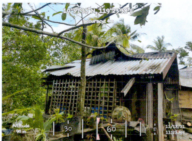
Damaged roof of the station and kitchen of FPMS III located at Sitio Ibangle, Bgy. Abongan, Taytay, Palawan