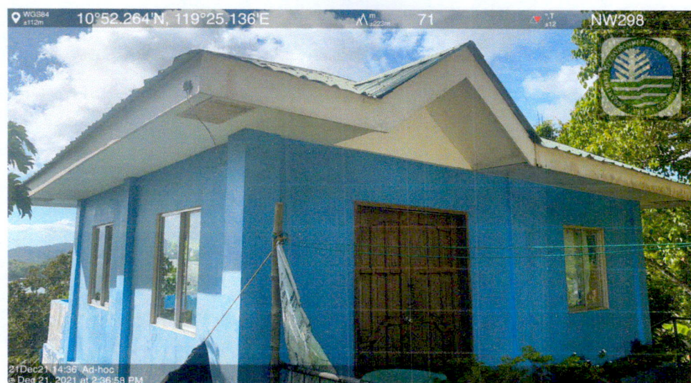
Situation of Visitors' Center in Bgy. Pancol, Taytay, Palawan; No Damage