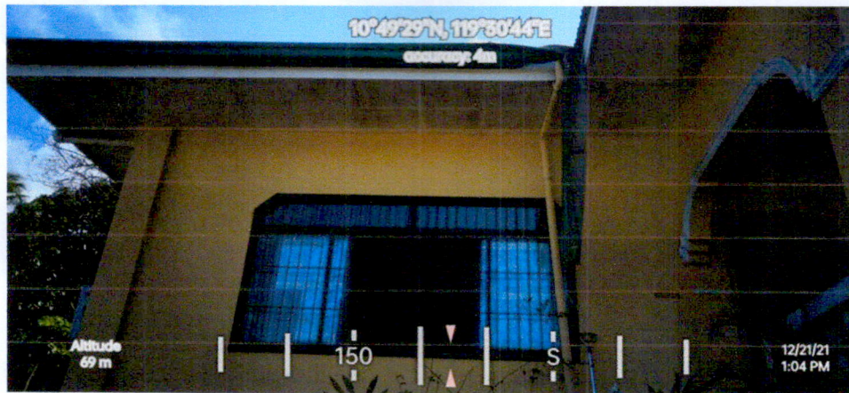
Partially damaged gutter of CENR Office in Taytay, Palawan