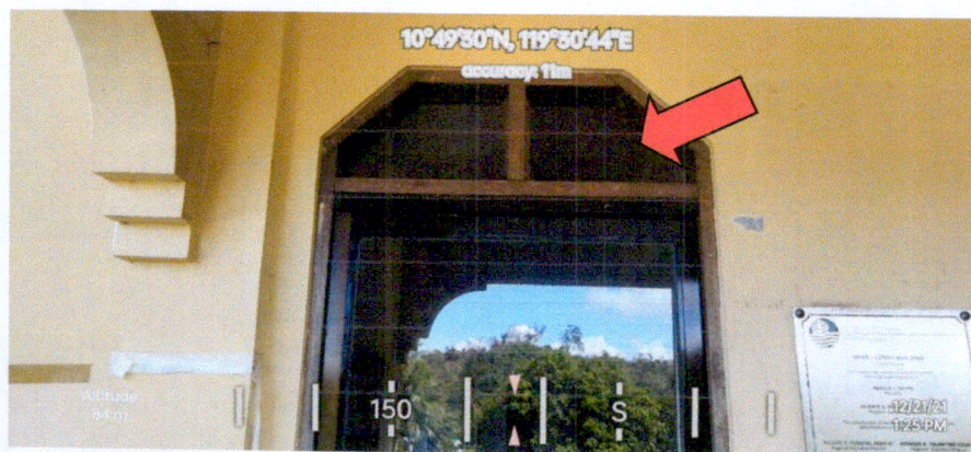
Broken glass pane above the maindoor of CENR Office in Taytay, Palawan