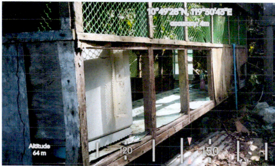
Partially damaged wall of pantry of CENR Office in Taytay, Palawan