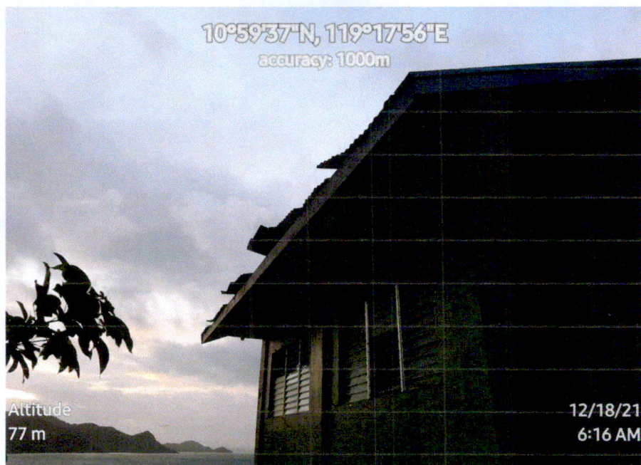
Partially damaged tin roof of the Park Ranger Station in Bgy. Tumbod, Taytay, Palawan