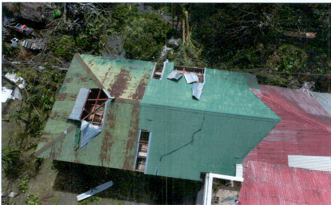
TOP VIEW OF NEW BUILDING