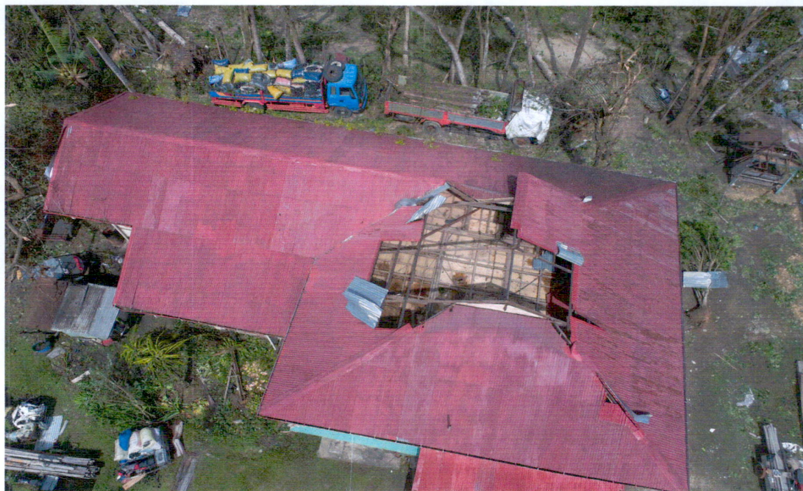
TOP VIEW OF OLD BUILDING