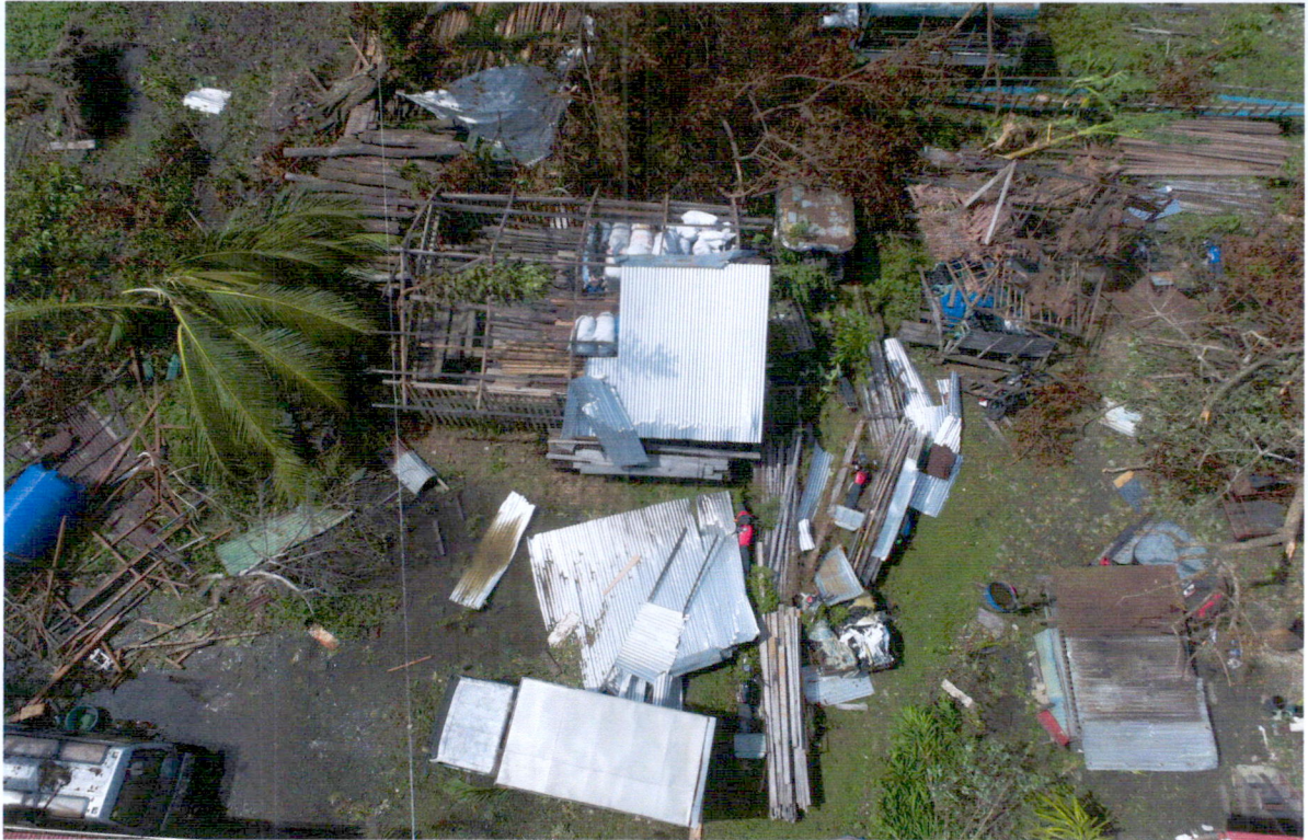
TOP VIEW OF LUMBER & CLIENT SHED, AND GUARD POST