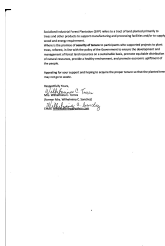
denr nov 2021.jpeg 411.8kB