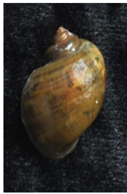
Figure 2.14: Pomacea canaliculata /golden apple snail