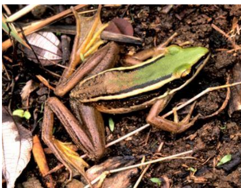
Figure 2.7: Hylarana erythraea /green paddy frog