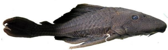
Figure 2.11: Hypostomus plecostomus /janitor fish.