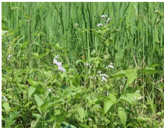
Figure 2.1: Chromolaena odorata /Siam weed, hagonoy