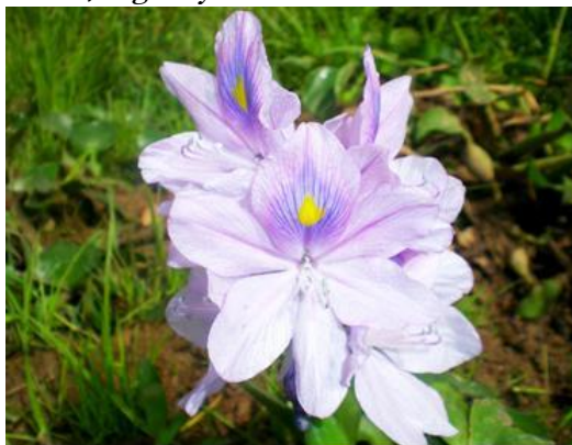
Figure 2.3: Eichhornia crassipes /water hyacinth