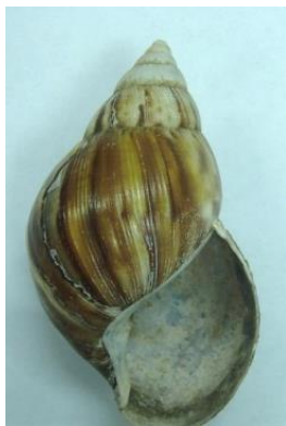
Figure 2.13: Achatina fulica /giant African snail