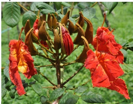
Figure 2.5: Spathodea campanulata /African tulip