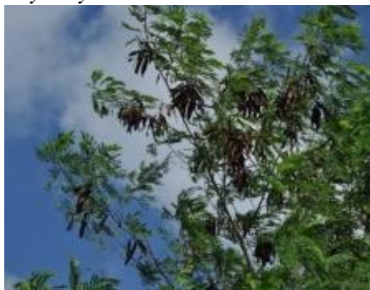
Figure 2.6: Leucaena leucocephala /ipil-ipil