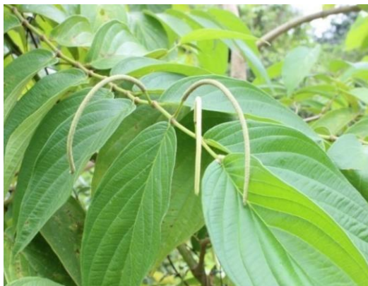
Figure 2.4: Piper aduncum /spiked piper, buyo-buyo