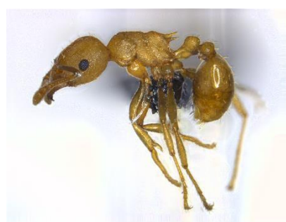
Figure 2.16: Tetramorium bicarinatum /penny ant