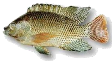
Figure 2.12: Oreochromis niloticus /Nile tilapia