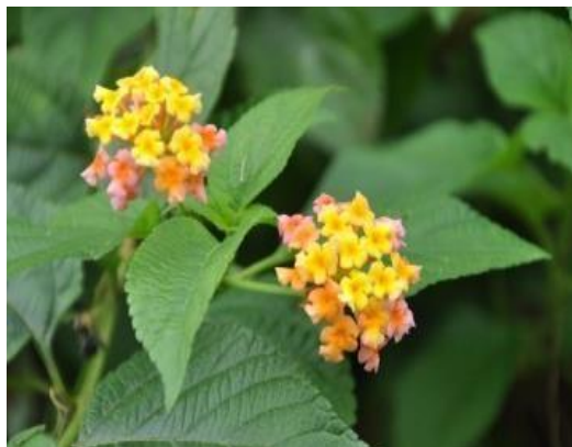
Figure 2.2: Lantana camara /lantana, coronitas