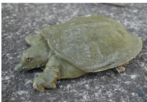
Figure 2.9: Pelodiscus sinensis /Chinese softshell turtle