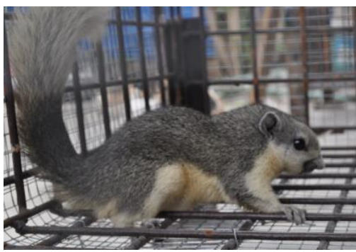
Figure 2.10: Callosciurus finlaysonii /variable squirrel