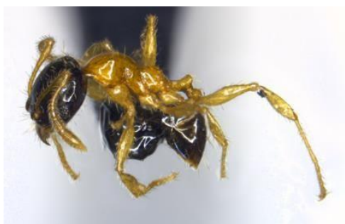
Figure 2.15: Monomorium floricola /bicolored trailing ant