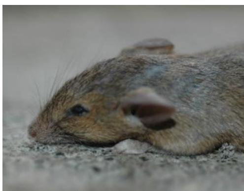
Figure 2.8: Rattus tanezumi /Oriental house rat