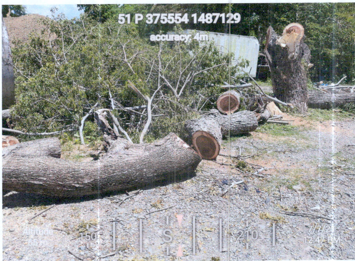
Geotagged Photos showing of logs inventoried within the private lot where illegal tree cutting activity occurred on July 7, 2021 located at Purok Dama De Noche, Barangay Tampus, Boac, Marinduque