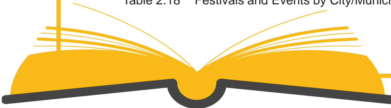
Table 2.18 Festivals and Events by City/Municipality, [Province]

Table 2.17 Number of Tourist Arrival, Domestic and Foreign, [Province]: 2015-2019