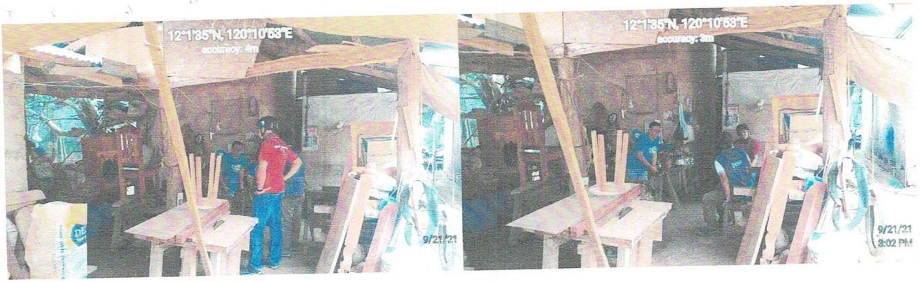
Privately operated by Rodolfo Zamora located at Sitio Deguiboy, Barangay 6, Coron, Palawan