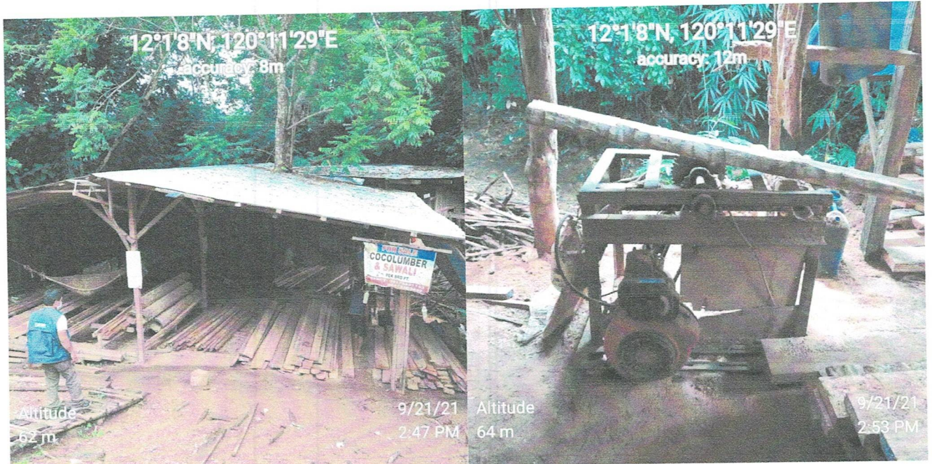
MJ Lumber & Trading, a coco lumber dealer located at Sitio Dipulao, Brgy. 6, Coron, Palawan