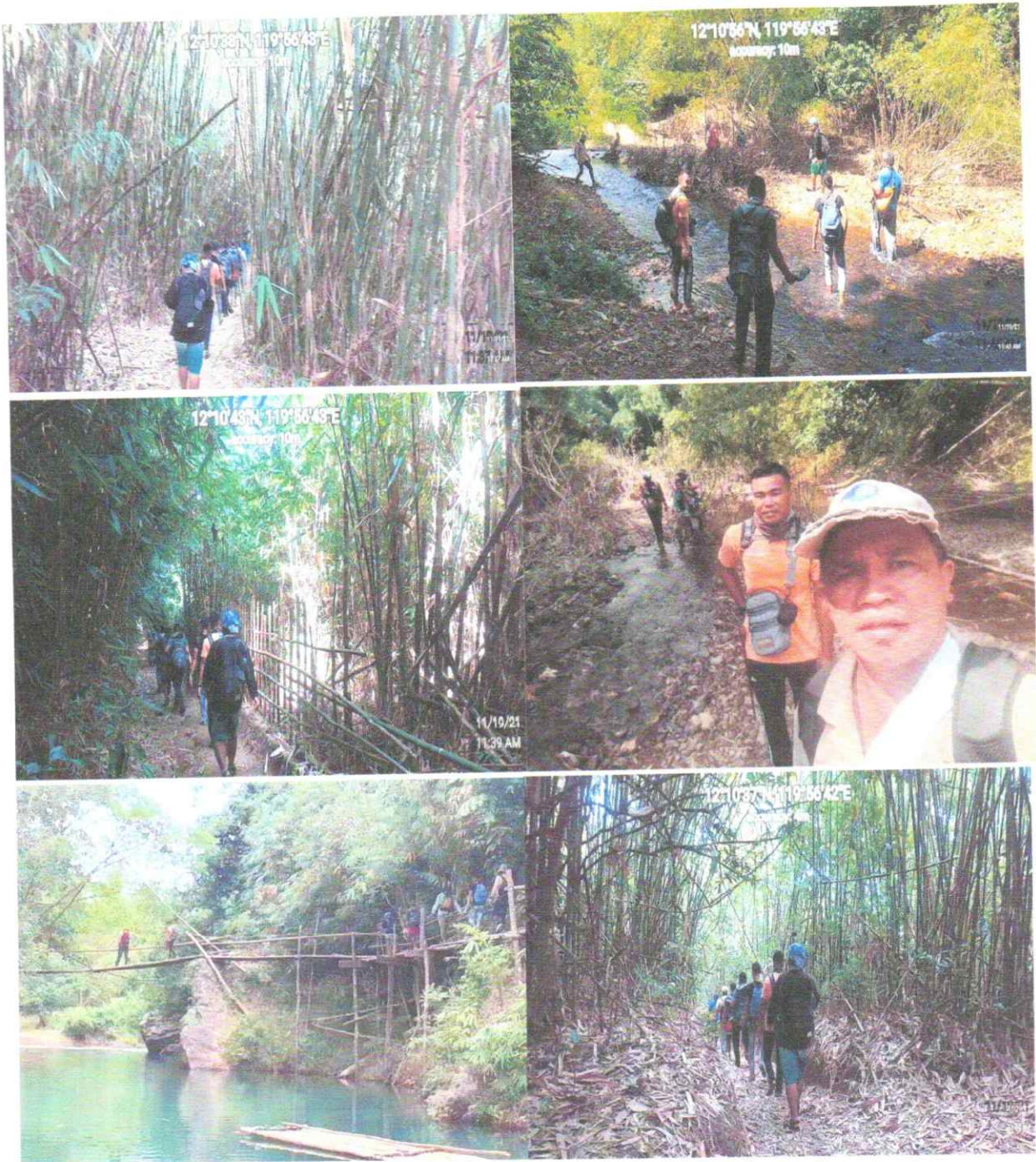
Photos during patrolling and monitoring