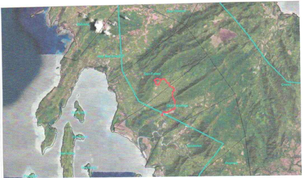
Patrol Image location map