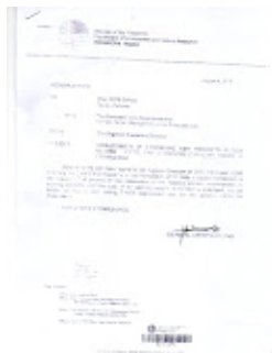
3. Memo RED-CENro.jpg 298K