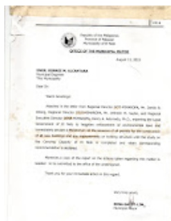
4. Order Mayor - OBO.jpg 417K