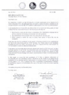
2. Lettter from DENR-DILG-DOT.jpg 552K