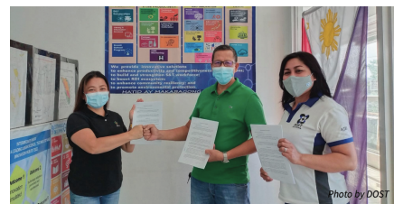
Memorandum of Agreement signed with DOST