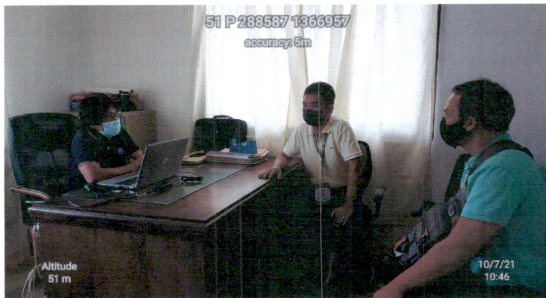
Meeting with the residence of So. Wawa, Brgy. Iriron, Calintaan, Occidental Mindoro as part of the investigation on the allege illegal cutting of trees in road construcion