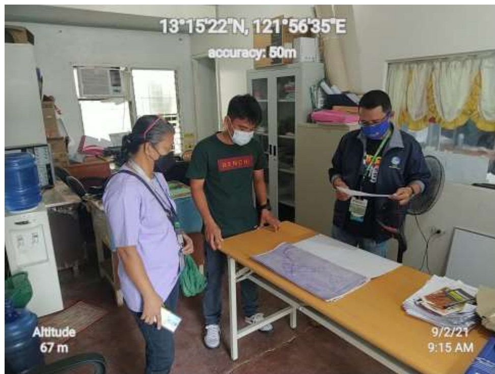
Coordination with the Office of the Municipal Assessor, LGU- Buenavista, Marinduque