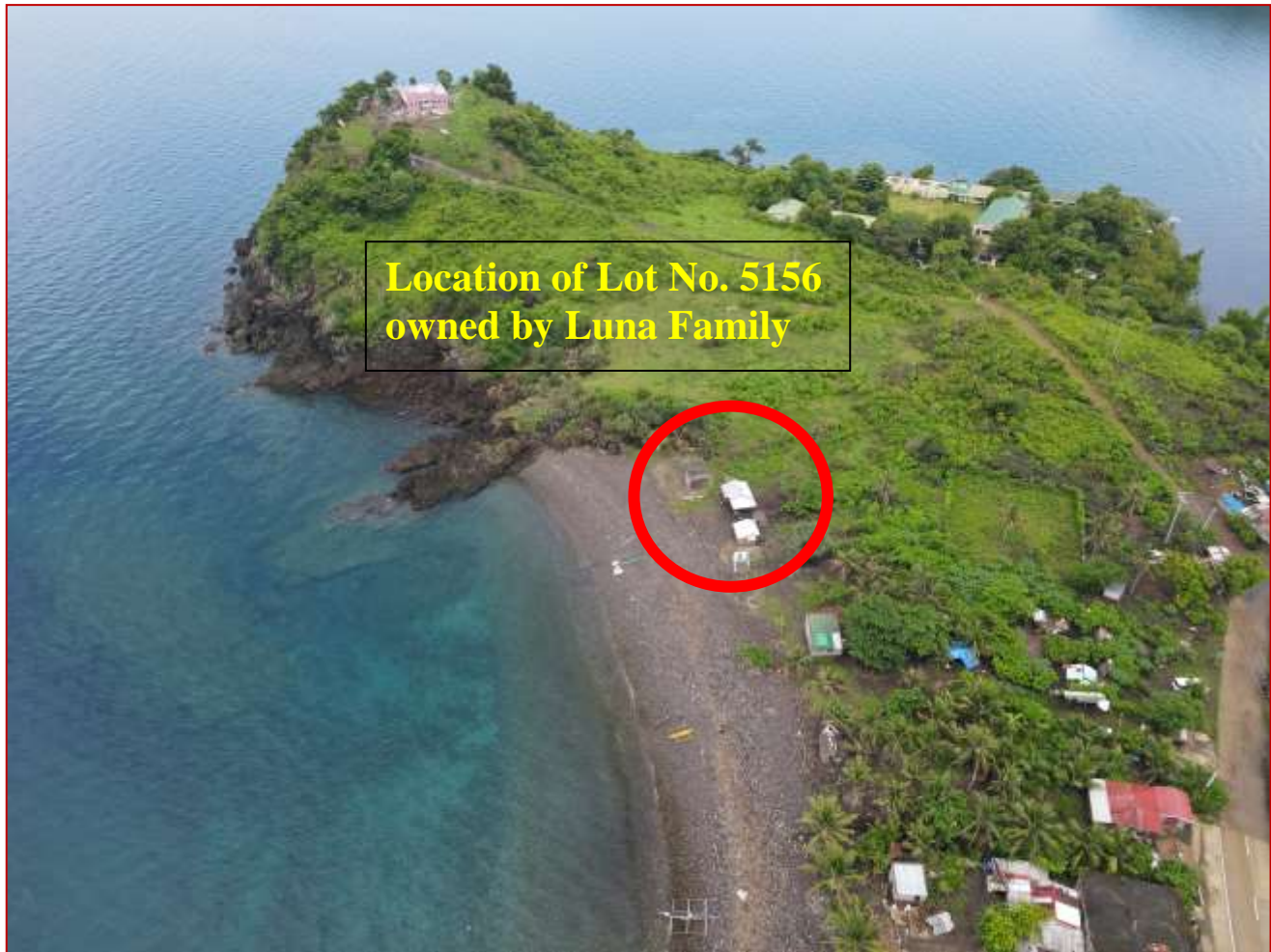
Drone shot showing the houses/structures (red circle) that had been built within the 20-meter salvage zone or along the shoreline of Brgy. Yook, Buenavista which is adjacently located to Lot No. 5156 owned by the Luna Family (yellow).