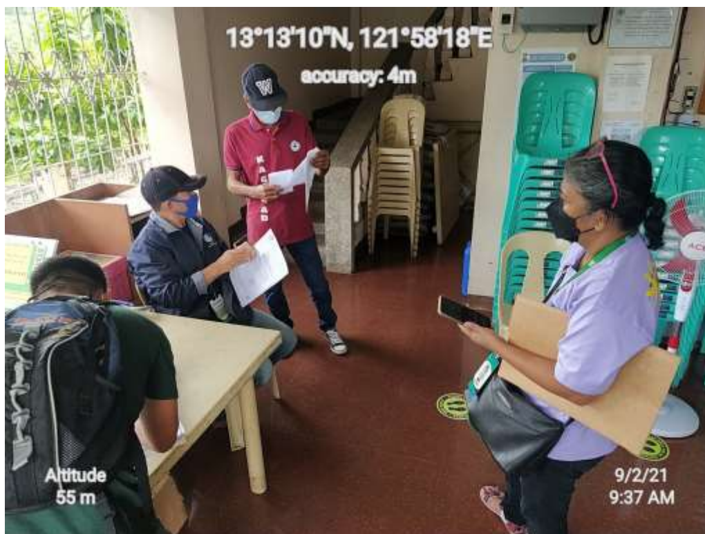
Coordination with LGU-Yook, Buenavista, Marinduque