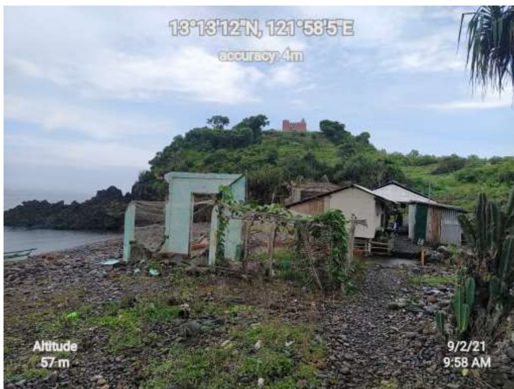
Showing several structures (active and abandoned) in the subject area.