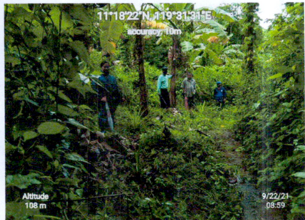
Banana intercropped with Pineapple