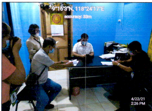
Photos during signing of Memorandum of Partnership Agreement on Rapid Land Tenure Appraisal by and between the DENR and LGU-Narra, Palawan on April 22, 2021 at the Office of the Municipal Mayor of Narra, Palawan