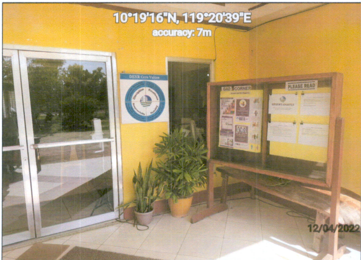
Panoramic view of Citizens Charter posters