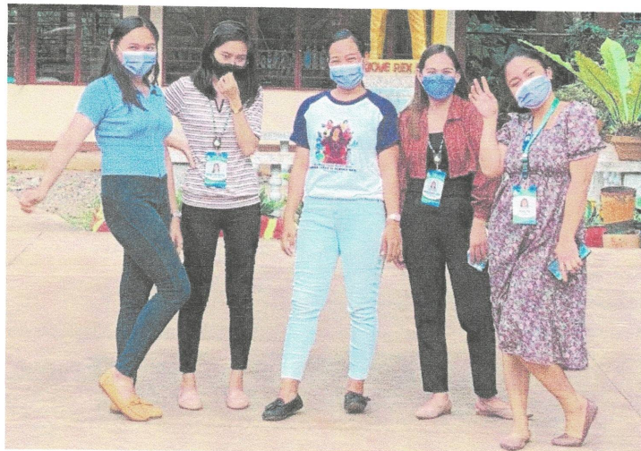
Facilitating and finalizing the coral identification using CPCe (left) and participating in the celebration of International Women's Day (right)