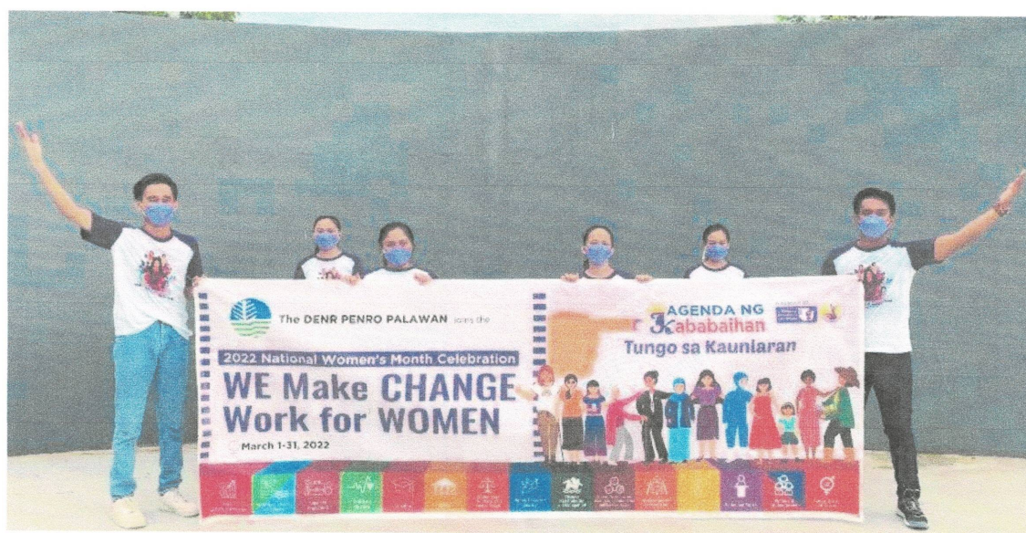
Photo during the rehearsal for the Regional JUANA Tiktok Contest