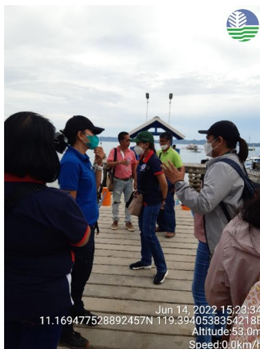
Field Work / Site Visit at the Corong Corong Cove