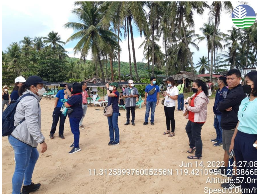
Field Work / Site Visit at the Nacpan Beach