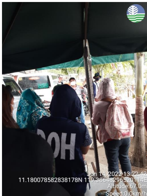
Field Work / Site Visit at the Corong Corong Pier