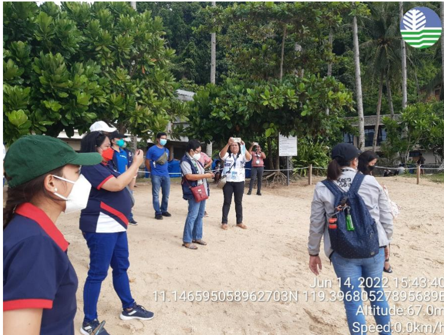
Field Work / Site Visit the Vanilla Beach