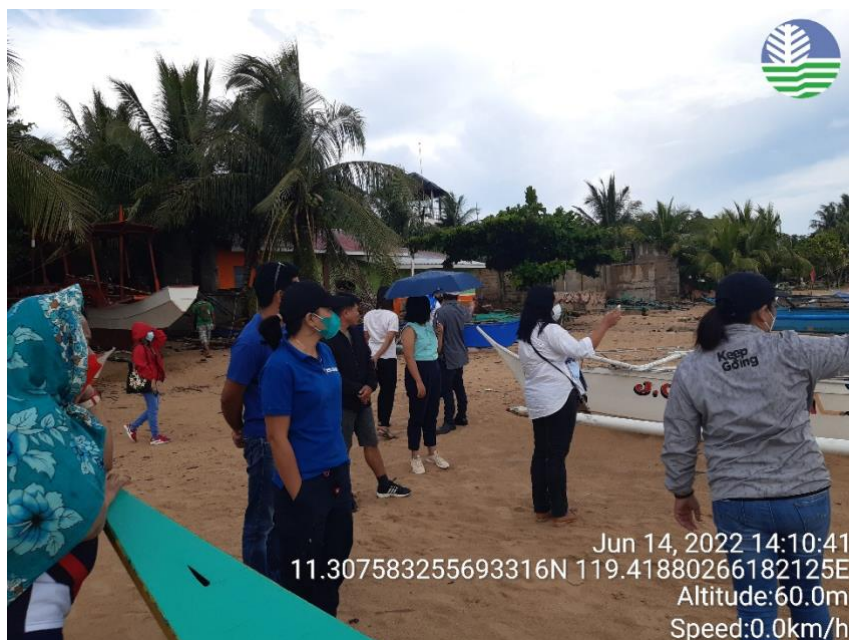
Field Work / Site Visit at the Calitang Beach