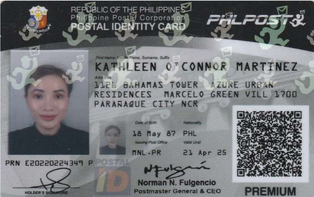
POSTAL ID – SCANNED PHOTO (FRONT)