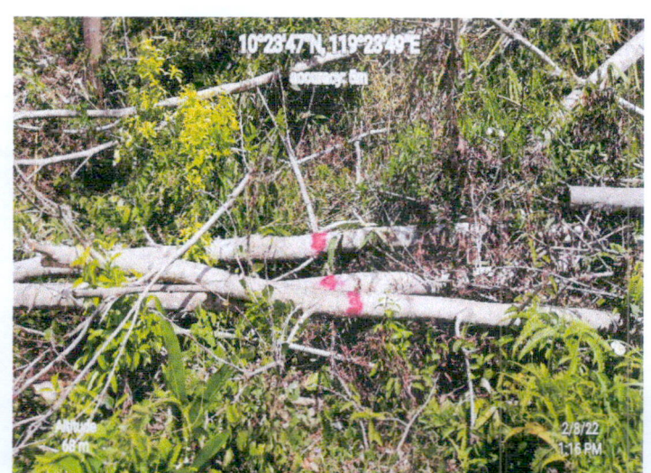
PICTURE SHOWING THE INVENTORY OF FALLEN AND UPROOTED TREES CAUSED BY TYPHOON ODETTE LOCATED AT BARANGAY SANDOVAL, ROXAS, PALAWAN