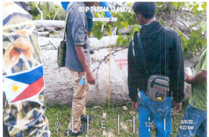
PICTURE SHOWING THE INVENTORY OF FALLEN AND UPROOTED TREES CAUSED BY TYPHOON ODETTE LOCATED AT BARANGAY ABAROAN, ROXAS, PALAWAN