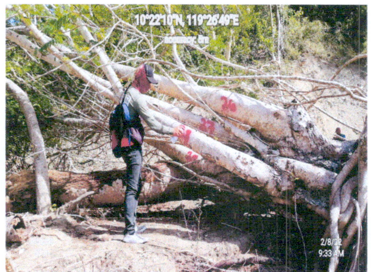
PICTURE SHOWING THE INVENTORY OF FALLEN AND UPROOTED TREES CAUSED BY TYPHOON ODETTE LOCATED AT BARANGAY TUMARBONG, ROXAS, PALAWAN