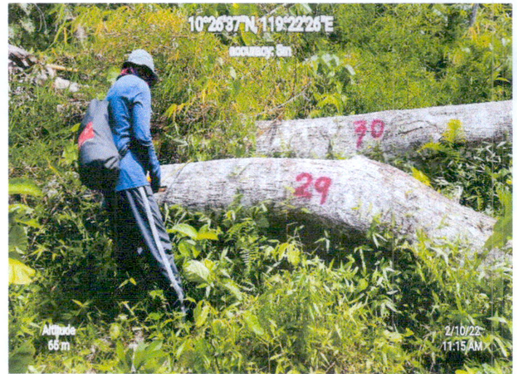
PICTURE SHOWING THE INVENTORY OF FALLEN AND UPROOTED TREES CAUSED BY TYPHOON ODETTE LOCATED AT BARANGAY DUMARAO, ROXAS, PALAWAN (RIVER SIDE)