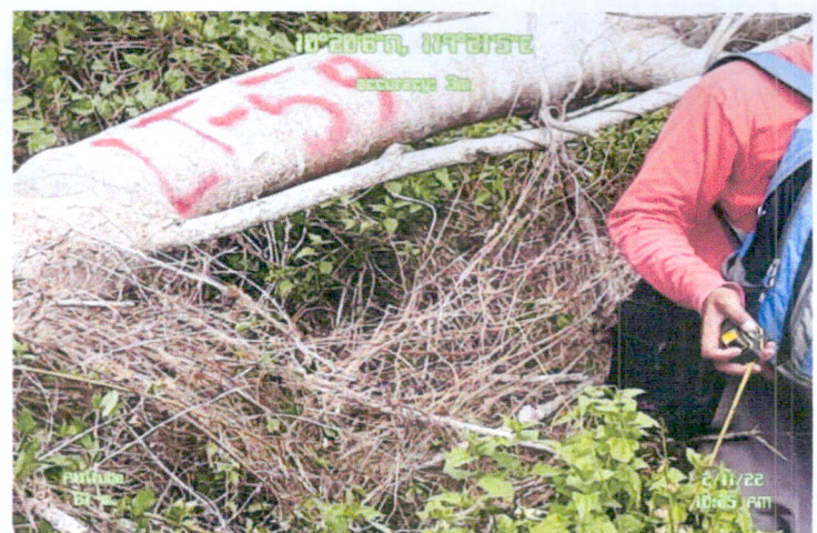
PICTURE SHOWING THE INVENTORY OF FALLEN AND UPROOTED TREES CAUSED BY TYPHOON ODETTE LOCATED AT RNCHS ROXAS, PALAWAN