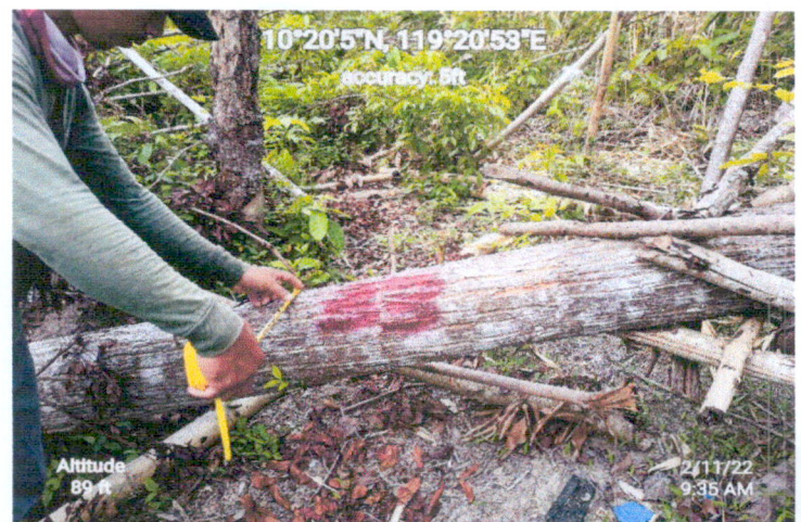
PICTURE SHOWING THE INVENTORY OF FALLEN AND UPROOTED TREES CAUSED BY TYPHOON ODETTE LOCATED AT PSU, ROXAS, PALAWAN