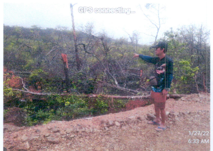
PICTURE SHOWING THE INVENTORY OF FALLEN AND UPROOTED TREES CAUSED BY TYPHOON ODETTE LOCATED AT DUMARAN, PALAWAN (MANGROVE AREA)