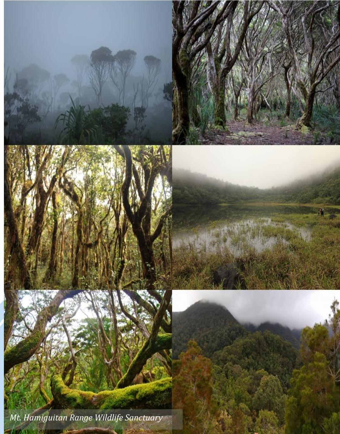
Mt. Hamiguitan Range Wildlife Sanctuary

Department of Environment and Natural Resources Biodiversity Management Bureau