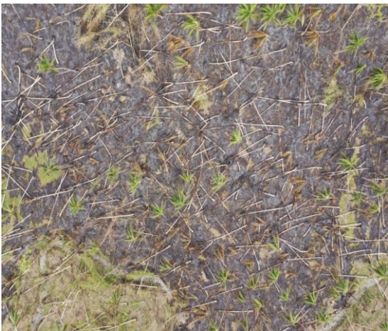
8 Hectares Fruit Trees Brgy. Asuncion, Malitbog, Southern Leyte