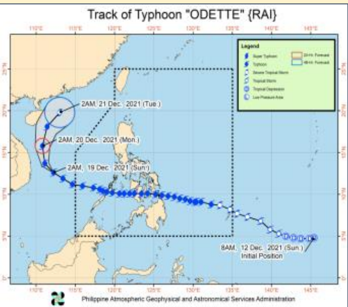
Historical and Forecast Track of TY "ODETTE" as of December 19, 2AM, and the locations and date/time of landfalls made by Typhoon "ODETTE"