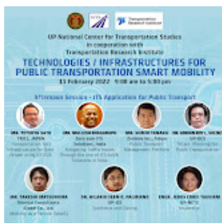
TRIC ITS webinar-11Feb2022-PM.jpg 584K