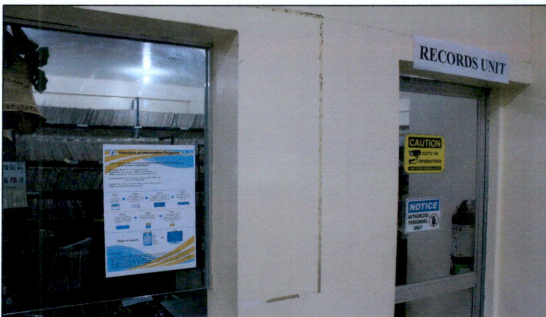
One-Page FOI Manual posted/displayed at the PENRO Marinduque – Records Unit