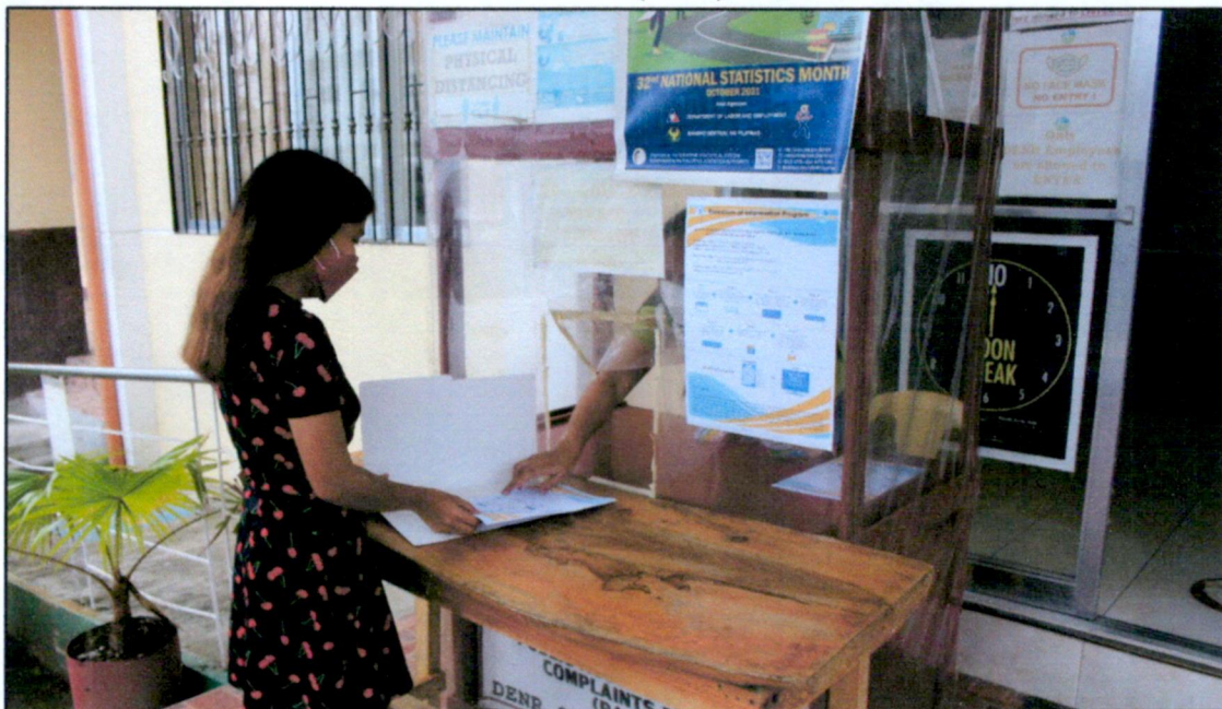
One-Page FOI Manual posted/displayed at the PENRO Marinduque – Receiving Area