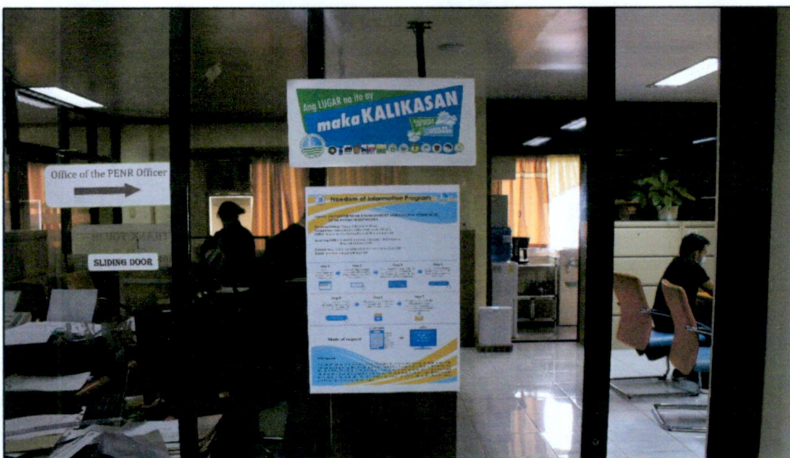
One-Page FOI Manual posted/displayed at the 2 nd Floor of the PENRO Building