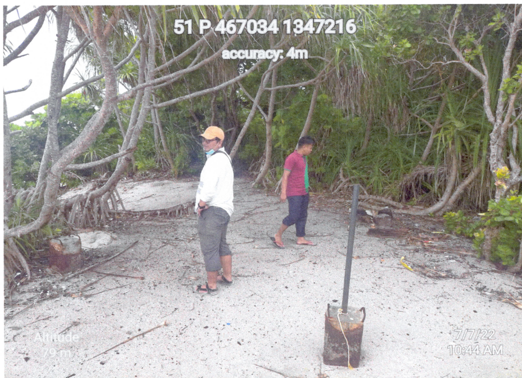
Photo No. 4: Area on top of the dunes where the LGU supposedly extracted sand for beautification purposes.