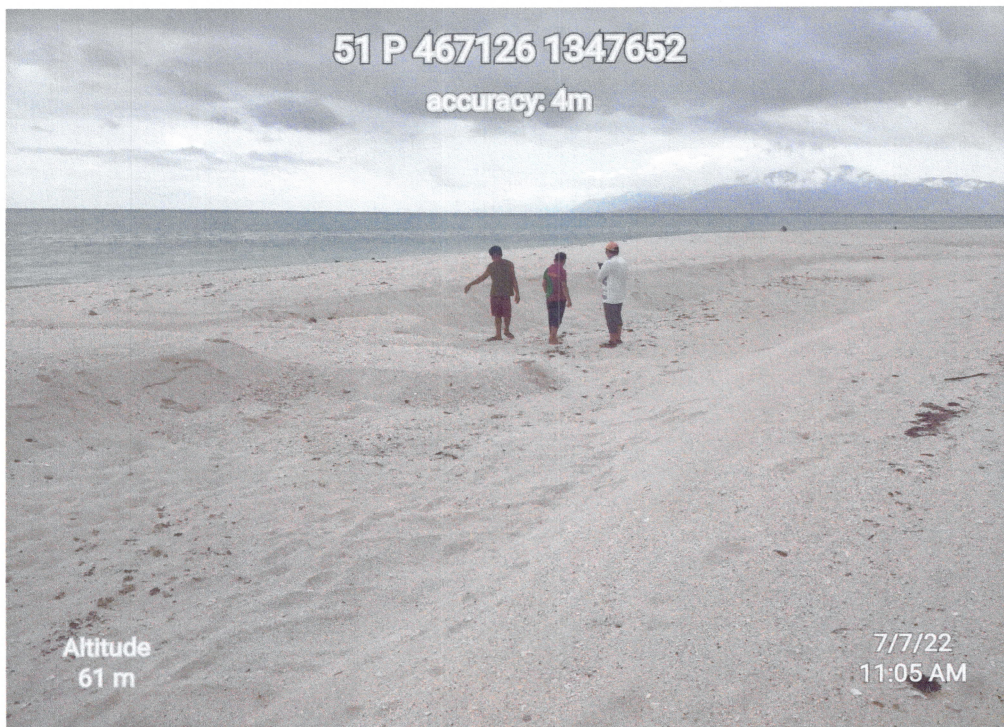
Photo No. 6: Runnel or beach lagoon where the drowning incident occurred.