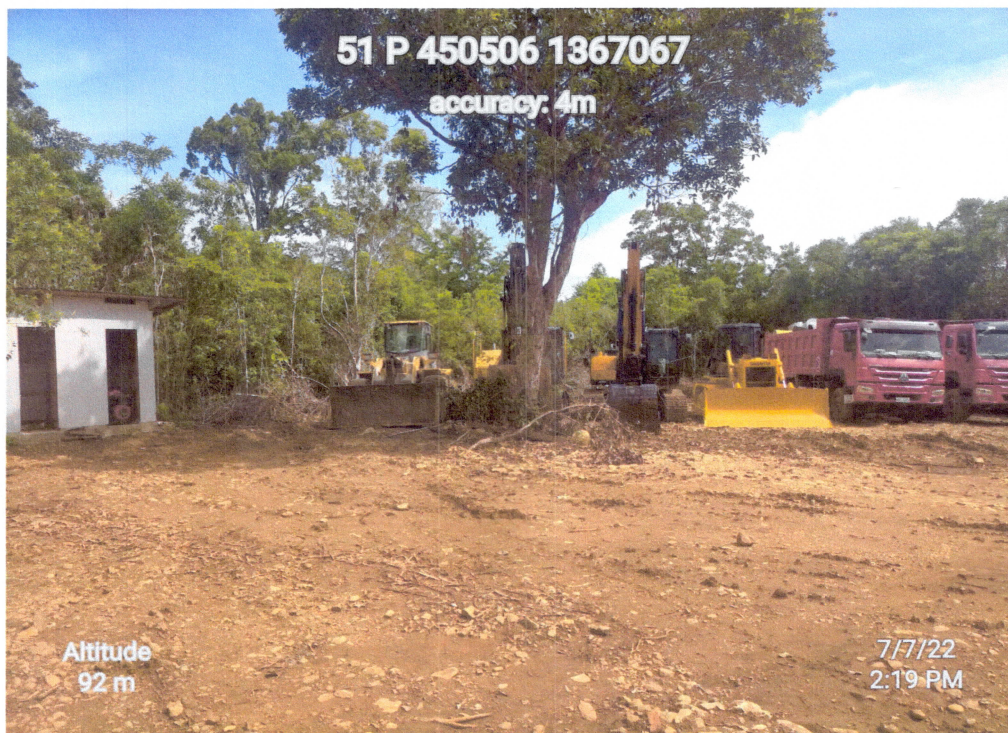
Photo No. 5: AMPC's loader, backhoe, and dump trucks parked within the compound.