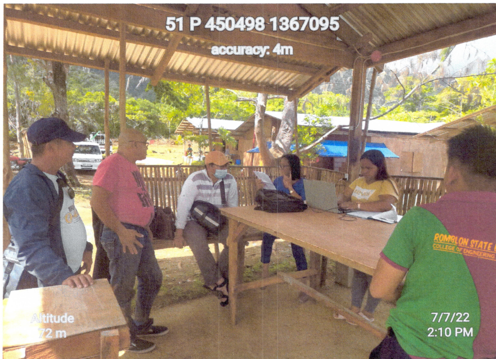
Photo No. 3: Brief discussion of the purpose of the visit with AMPC officers.