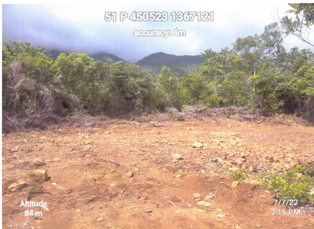
Photo No. 4: Cleared out bushes and shrubs set aside to the bounds of the compound.