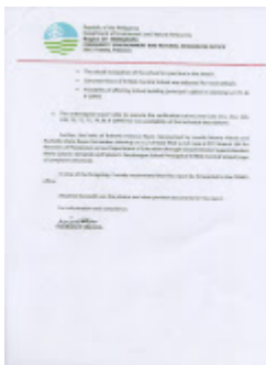
enr lachica survey002.jpg 803K