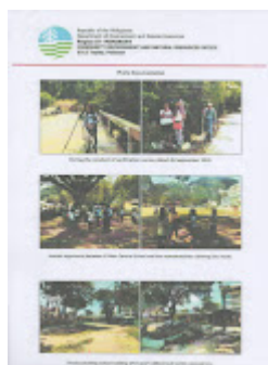
engr lachica survey003.jpg