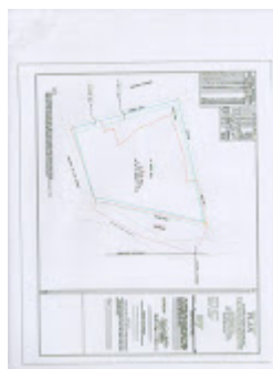
engr lachica survey004.jpg