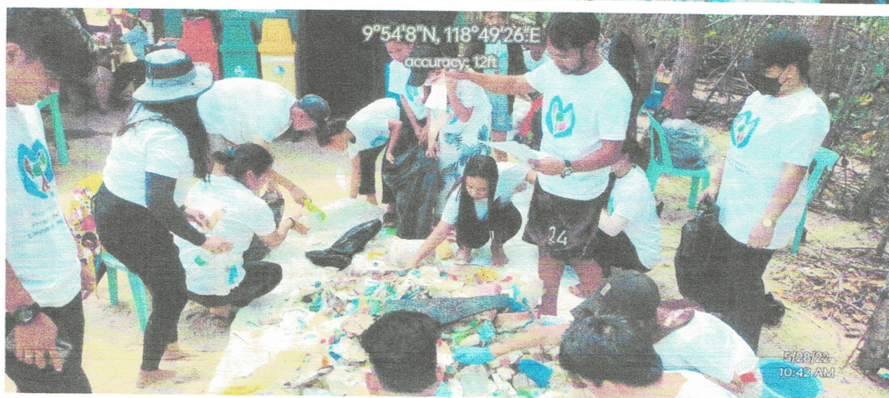
Photos during the sorting and classification of collected marine debris