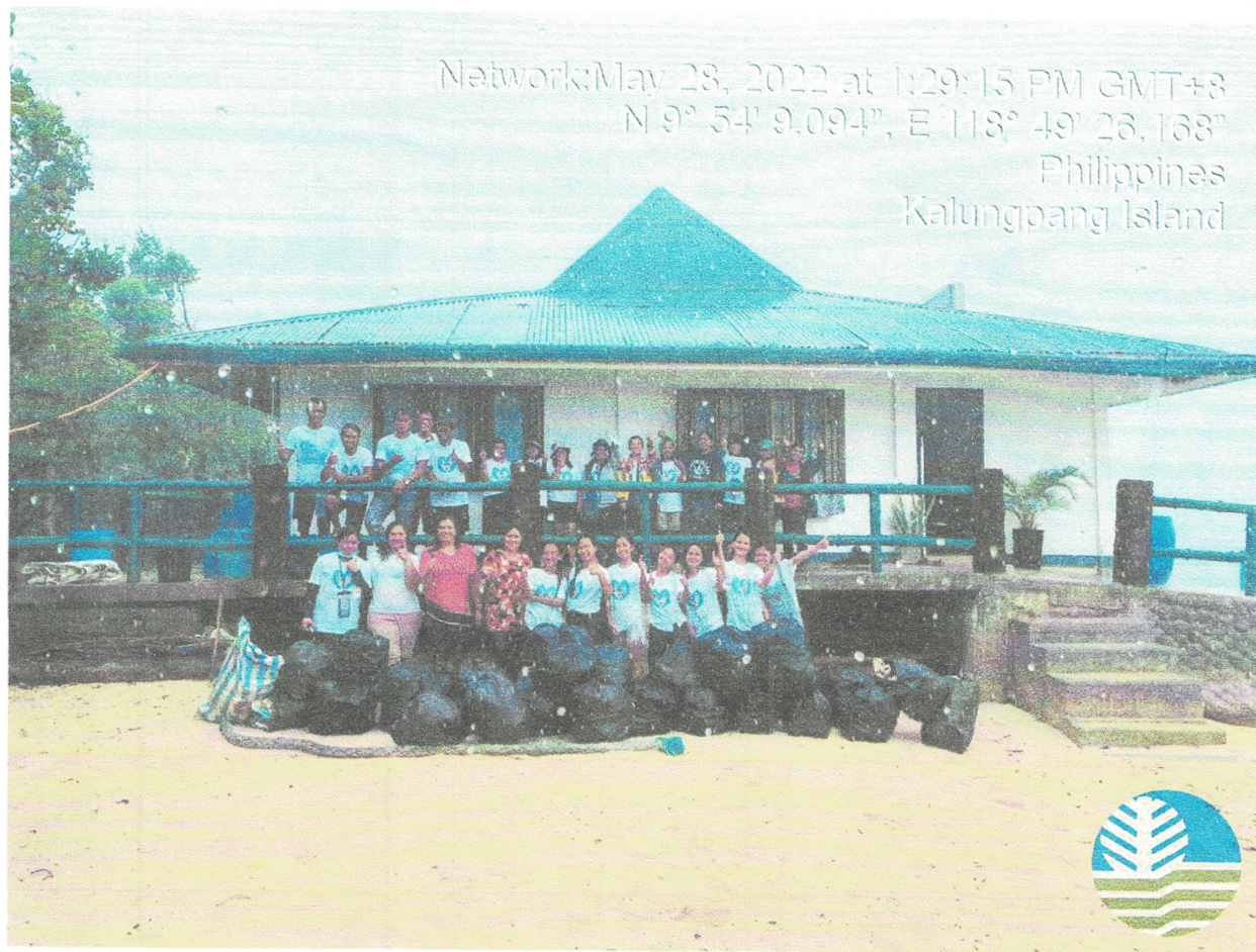
Group photo of all participants in the clean-up drive activity

Telfax No. (048) 433-5638 / (048) 433-5638