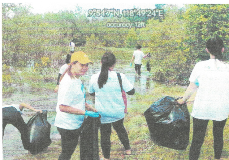
Photos during the actual coastal clean-up at Snake Island NCMCR