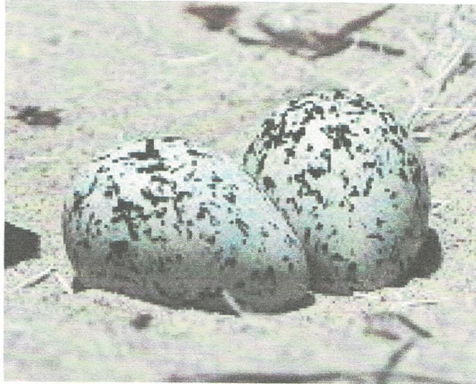
Eggs of Malaysian Plover, Charadrius peronii