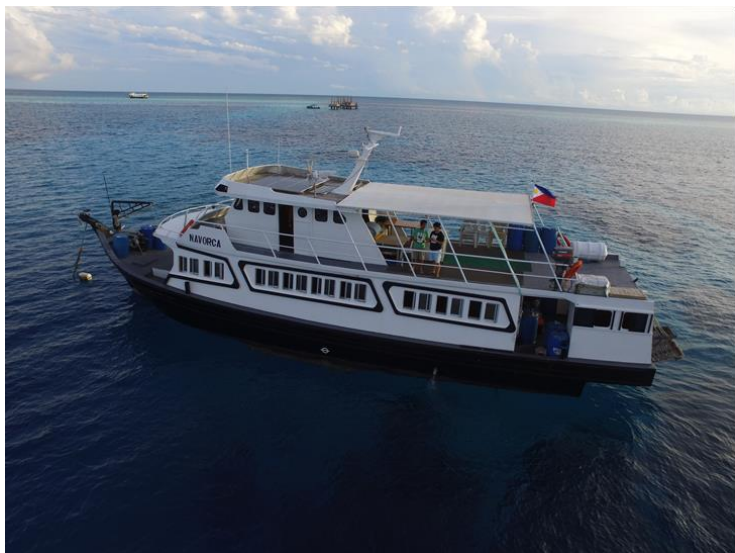
Figure 1. WWF research vessel, M/B Navorca, is 61 feet long and is manned by a crew with years of experience in Tubbataha.