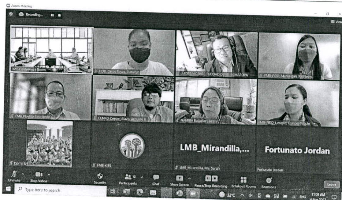
Screen capture of the attendees