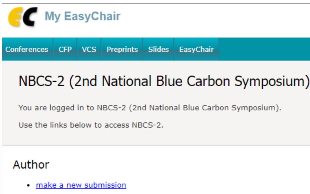
Figure 4. Abstract submission page of NBCS-2.

You will be directed to the New Submission for NBCS-2 page (Fig. 5). Be sure to follow the instructions carefully before clicking on the Submit button.