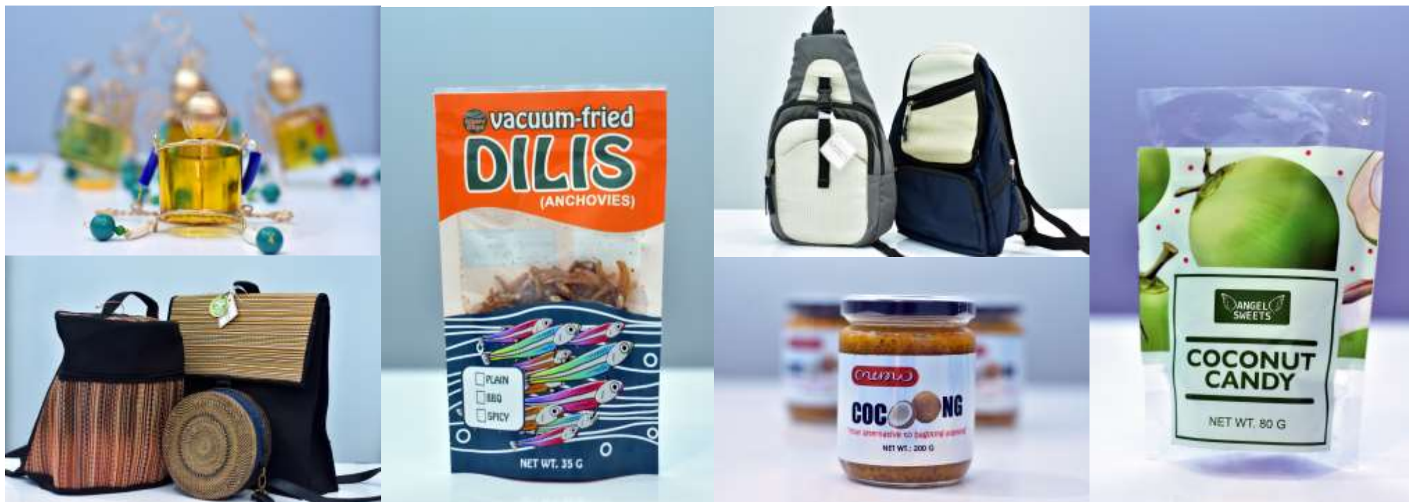
Sample Prototypes developed under Regional Integrated Product Development Assistance (RIPDA)