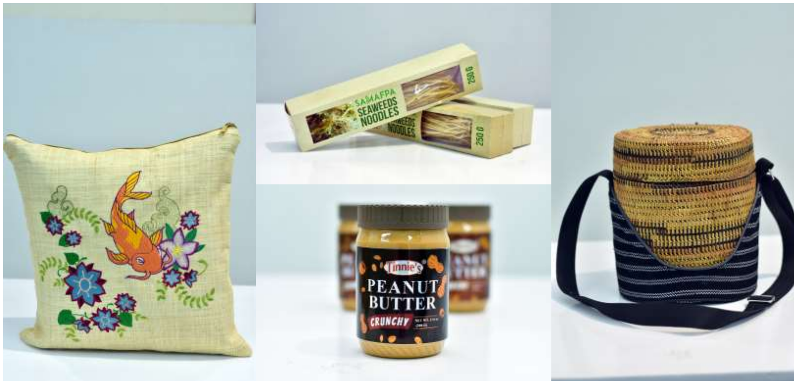
Sample Prototypes developed under Regional Integrated Product Development Assistance (RIPDA)