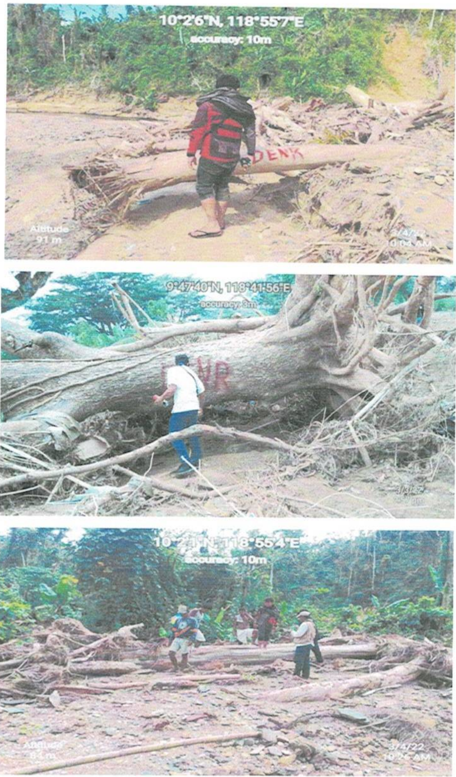
Attachment 3. Pictures of some beneficiaries of the donated felled/uprooted trees.