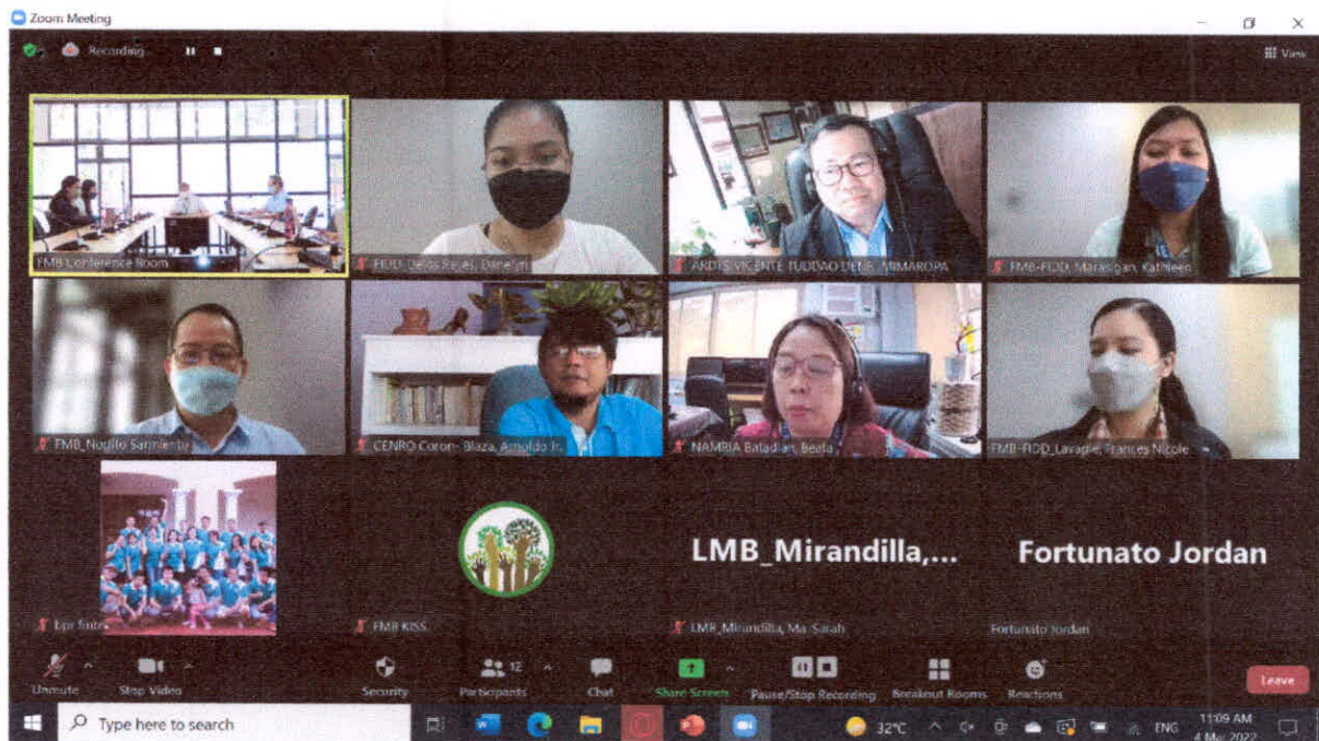
Screen capture of attendees