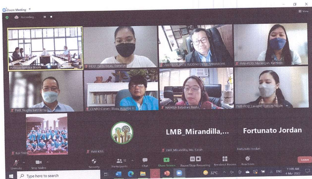
Screen capture of attendees