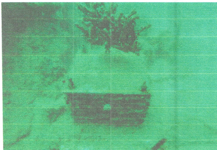
Secured ARMS unit at 18 meters' depth