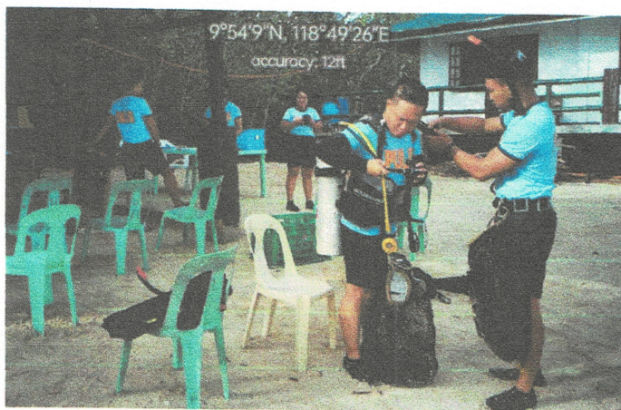
Photos during the conduct of "Scubasurero" of 2 nd SOU-MG at Snake Island on April 21, 2022