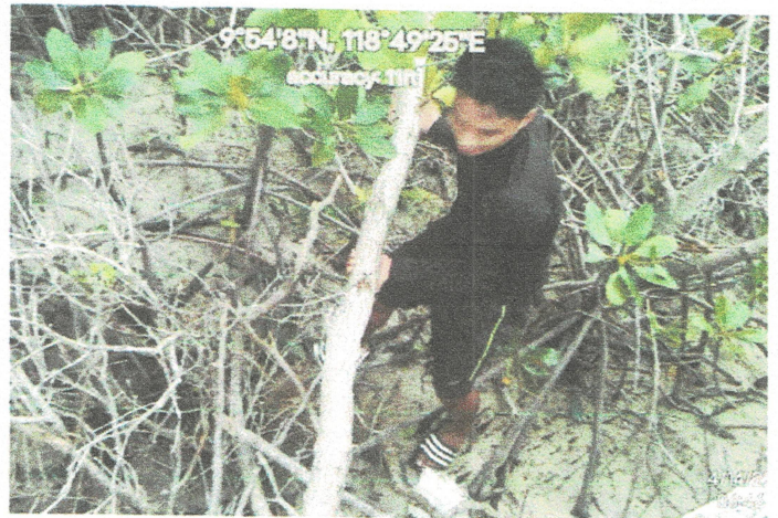
Photos during the continuous clearing of felled mangroves caused by Typhoon Odette at Snake Island on April 14, 2022