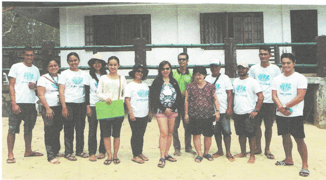
Photos during the ocular inspection of USec Teh and Director Basug at Snake Island on April 22, 2022