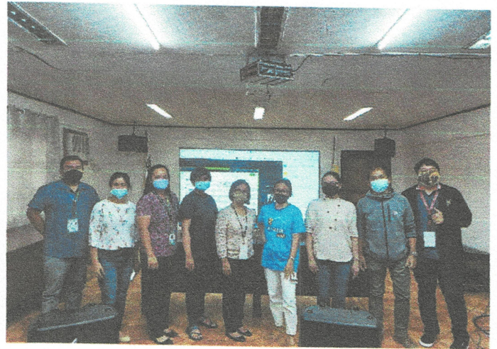
Photos during the conduct of South China Sea-SAP meeting at PENRO Training Hall on April 7, 2022