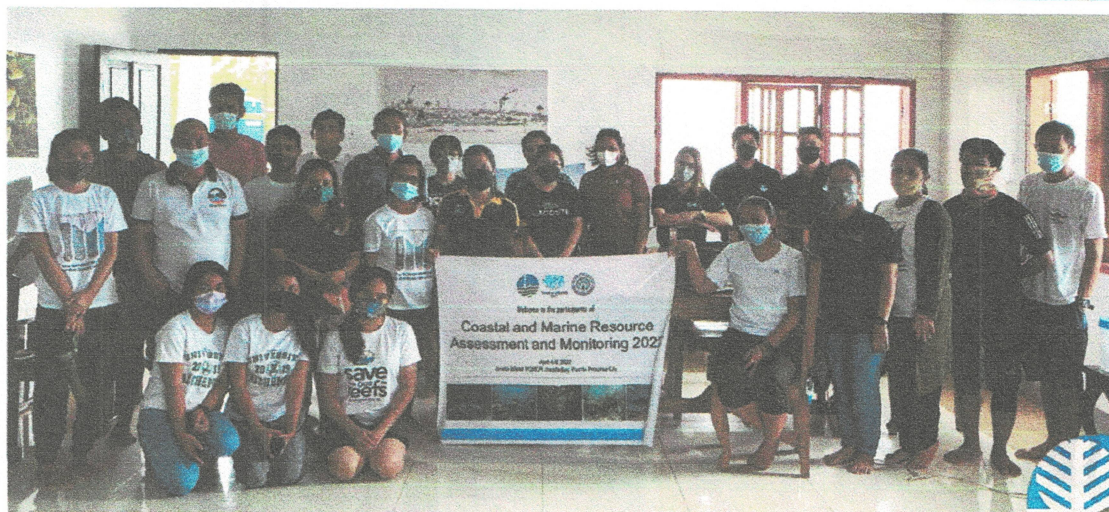
Photos during the conduct of CMRAM-dry season at Snake Island NCMCR on April 4-8, 2022