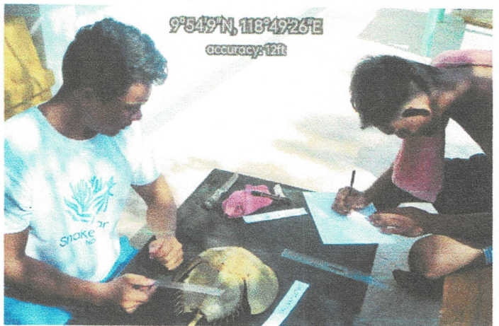
Photos during the conduct of morphometrics of by-caught Horseshoe crabs at Snake Island on April 20, 2022