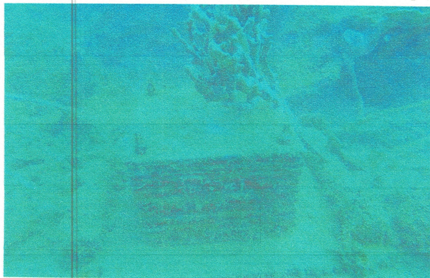
Secured ARMS unit at 18 meters' depth