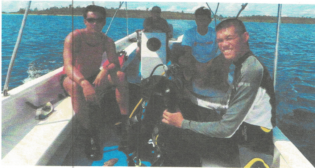
Monitoring team bound to deployment area