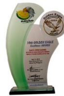
2018 TRAVEL & TOURISM CHANNEL OF THE YEAR