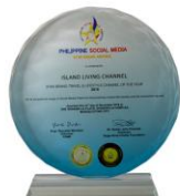
2018 STAR BRAND TRAVEL & LIFESTYLE CHANNEL OF THE YEAR