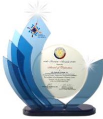
2020 PHILIPPINES' LARGEST LIFESTYLE AND TRAVEL CHANNEL