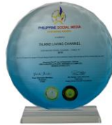
2019 STAR BRAND TRAVEL CHANNEL & CABLE CHANNEL