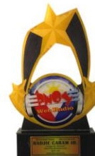
2017 OUTSTANDING TRAVEL HOST OF THE YEAR