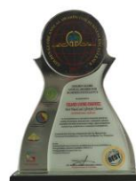
2017 BEST TRAVEL AND LIFESTYLE CHANNEL

Maraming, Marami Salamat Po! TO GOD BE THE GLORY!