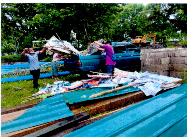
Pictures taken during the conduct of Operation/Oplan Baklas on April 12, 2022 along and within Bgy. Tabon, Bgy. Alfonso XIII, and Bgy. Pinaglabanan, Quezon, Palawan.