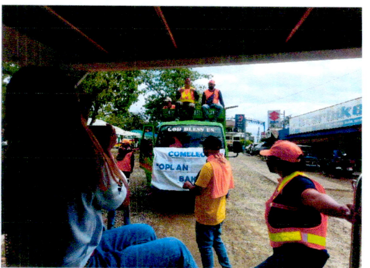
Pictures taken during the conduct of Operation/Oplan Baklas on March 25, 2022 within Bgy. Tabon and Bgy. Alfonso XIII, Quezon, Palawan.