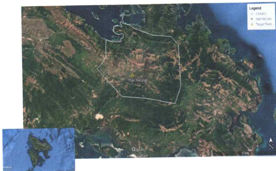
Figure 1. Location map of the sand and gravel quarry in San Nicolas. The white line denotes the barangay boundary.