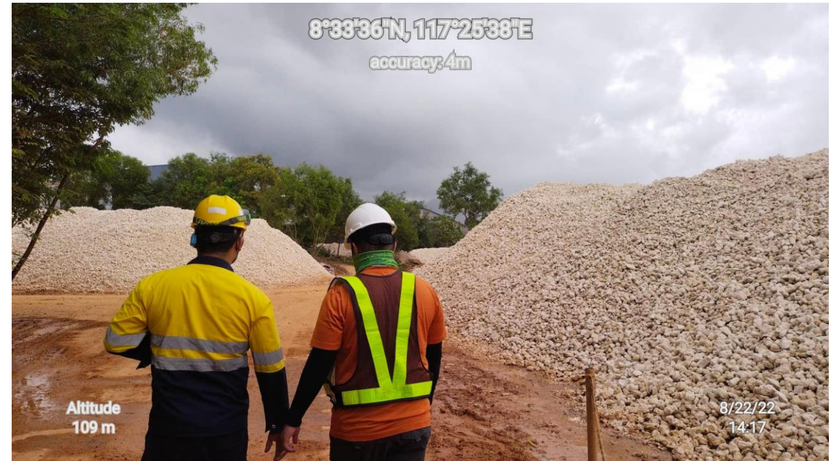
Photo 4. MMT members inspect GPI limestone stockyard.