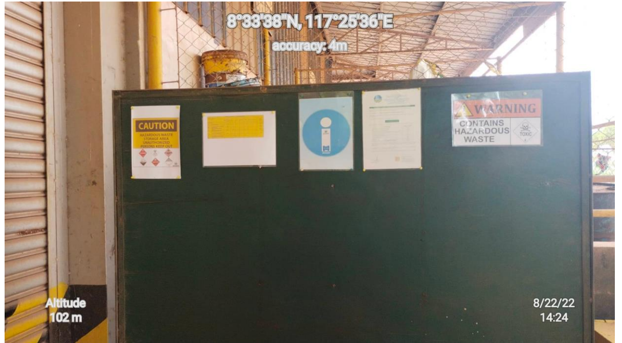
Photo 6. Organized inventory of hazwaste and safety signs are observed