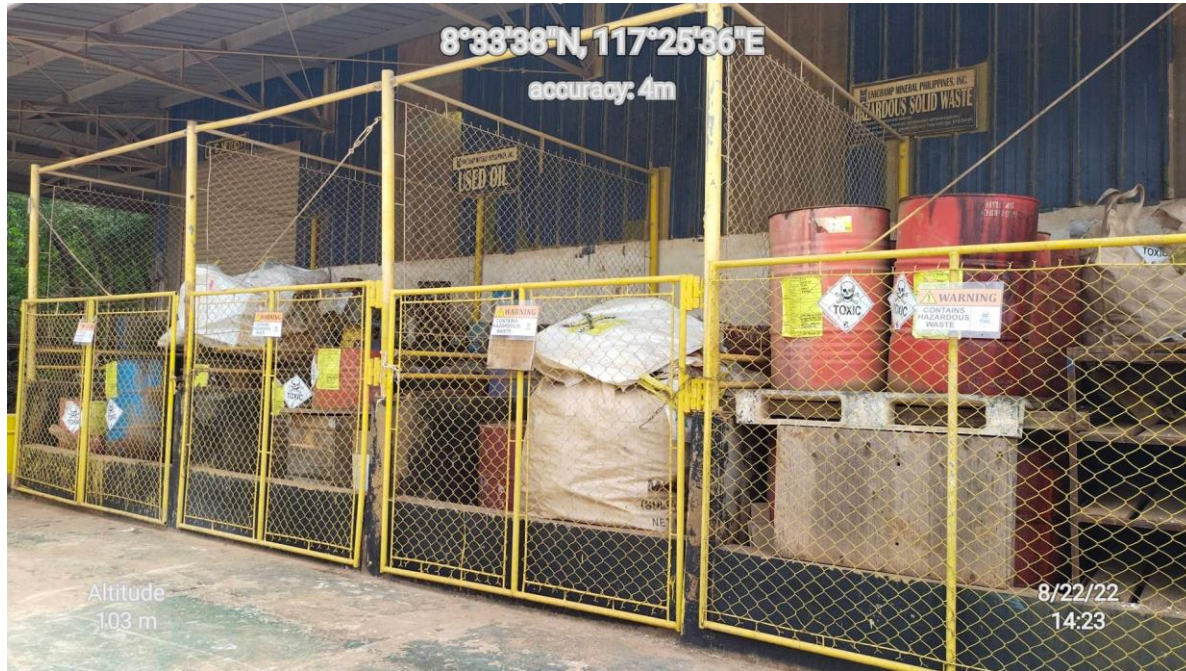
Photo 5. Hazwaste Storage area is properly labelled and properly secured with barricade