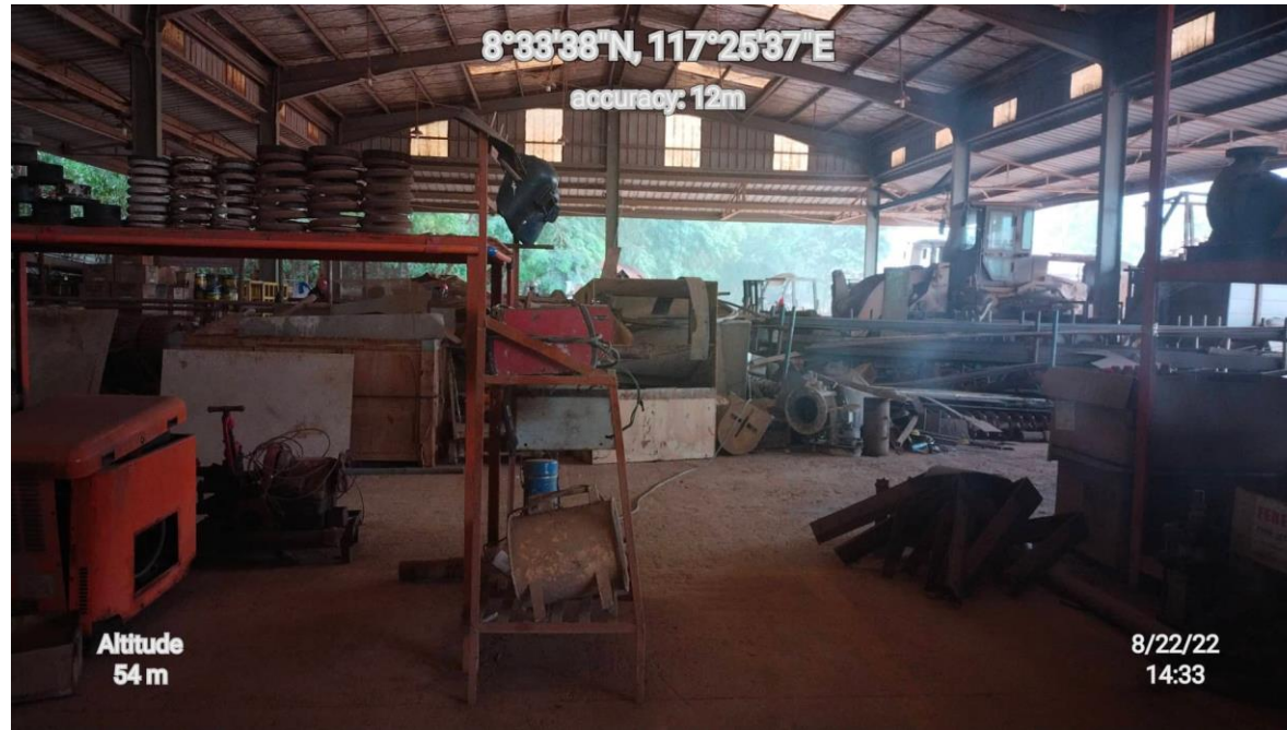
Photo 9. Improved housekeeping in the mechanical workshop observed during the validation.