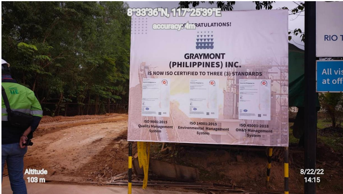
Photo 3. GPI secured ISO certification: Quality Management System, Environmental Management System and OH&S Management System