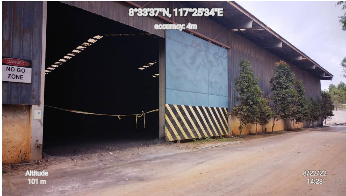
Photo 7. Well maintained and good housekeeping of Petcoke storage facility