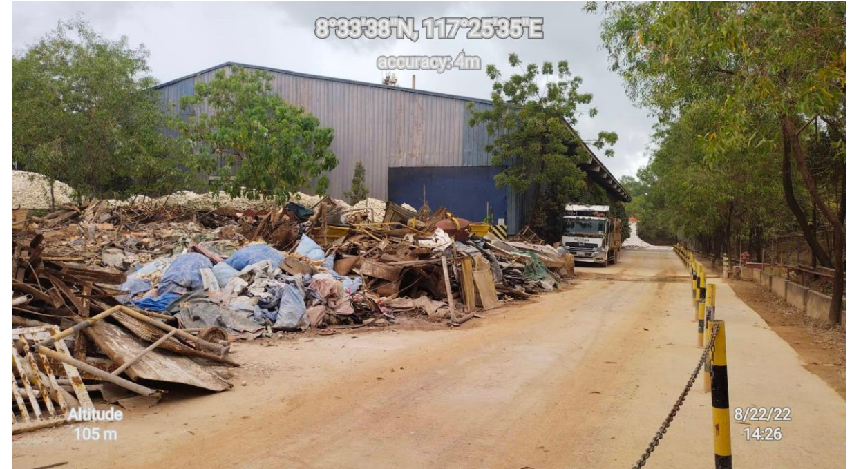
Photo 8. On going hauling of scrap materials noted.