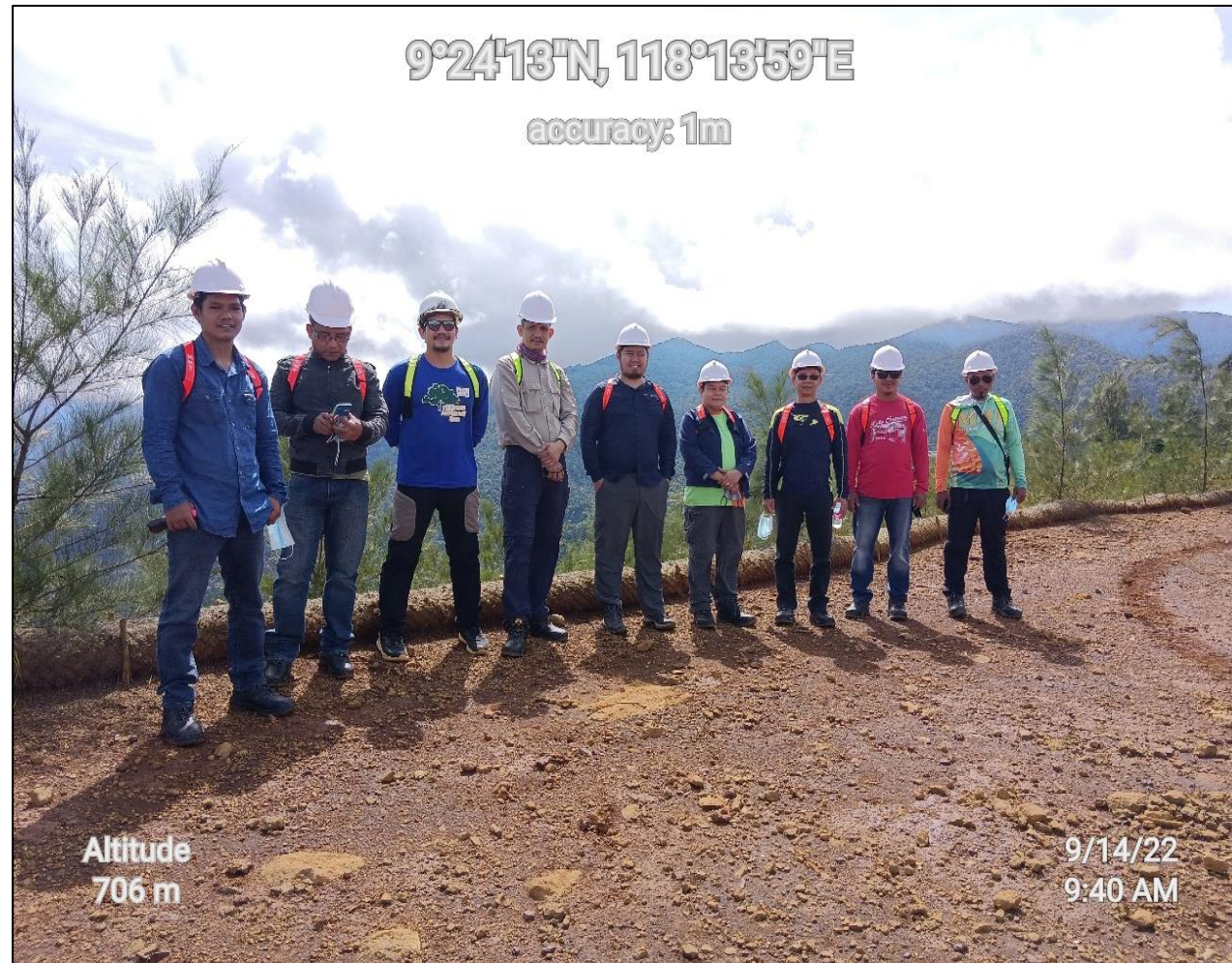
Photo 1. Multi-Partite Monitoring Team (MMT) Members for Berong Nickel Mining Project