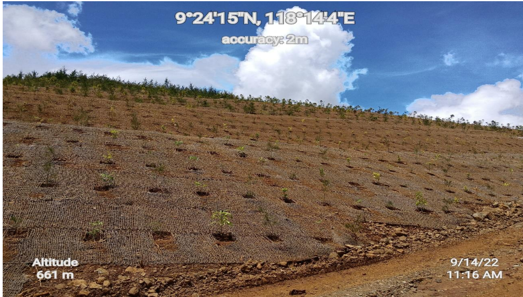
Photo 9. Planted seedlings (mahogany, batino etc.) at the Rehabilitation Area 2 and Area 12(2 nd Quarter)