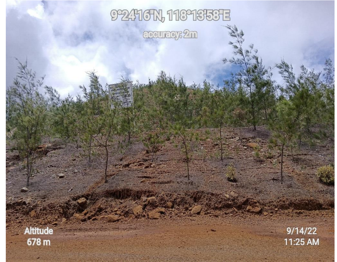
Photo 7 & 8. Observed thriving indigenous tree species (mahogany, batino, agoho, etc.,) planted at the Rehabilitation Area 11 (left) and Area 3 (right)