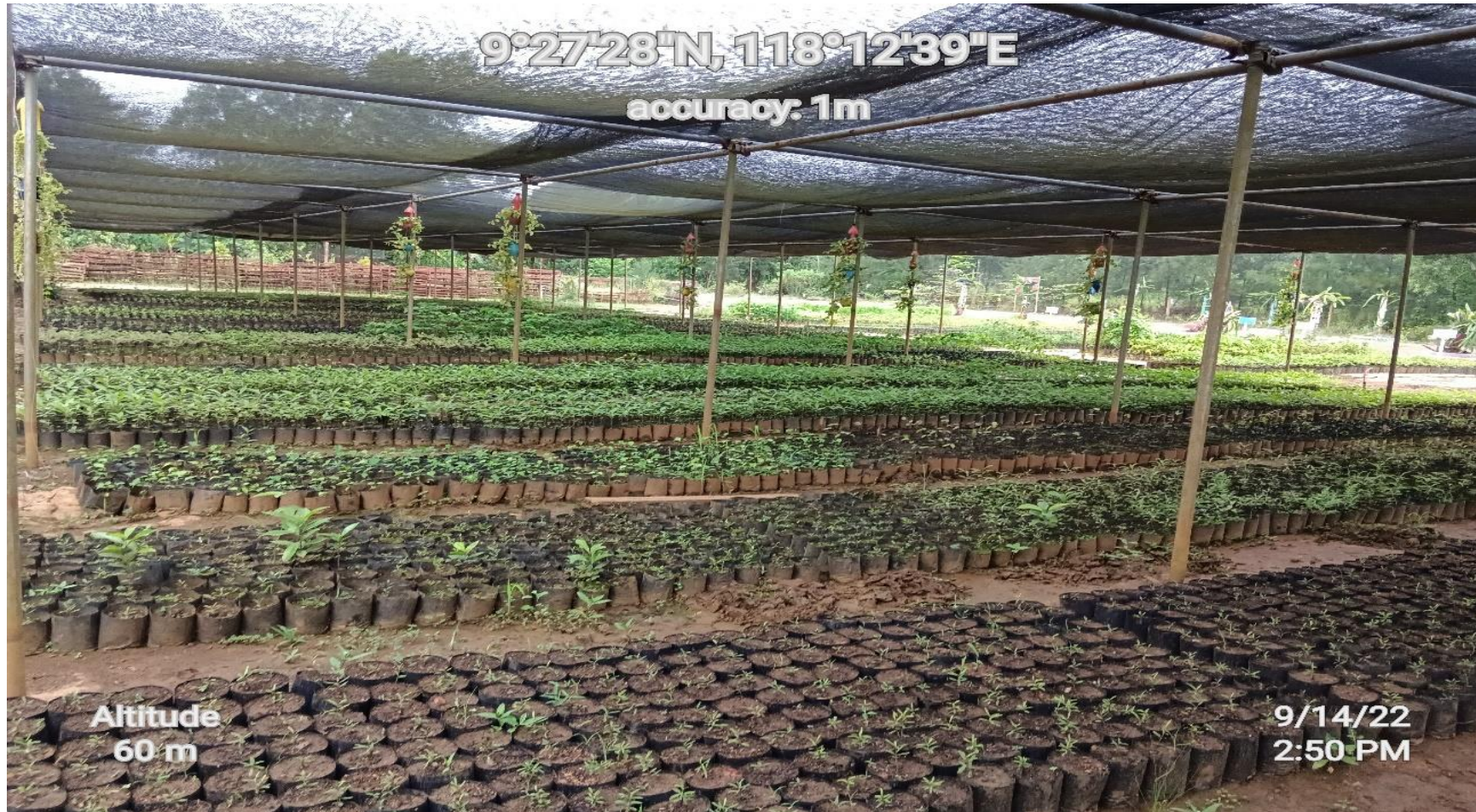
Photo 17. Production of different species of indigenous seedlings at the Nursery.