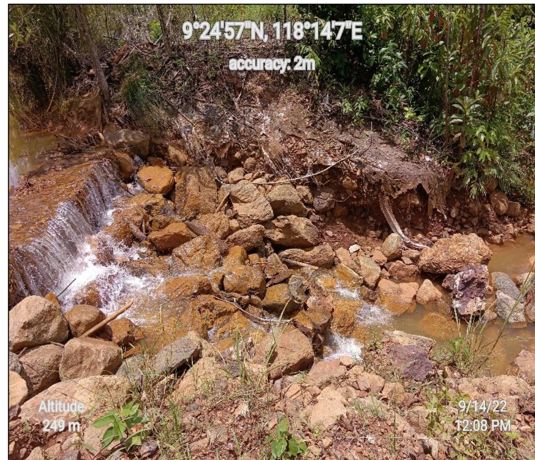
Photo 15. Series of siltation pond in KM. 7 observed to be in good condition.