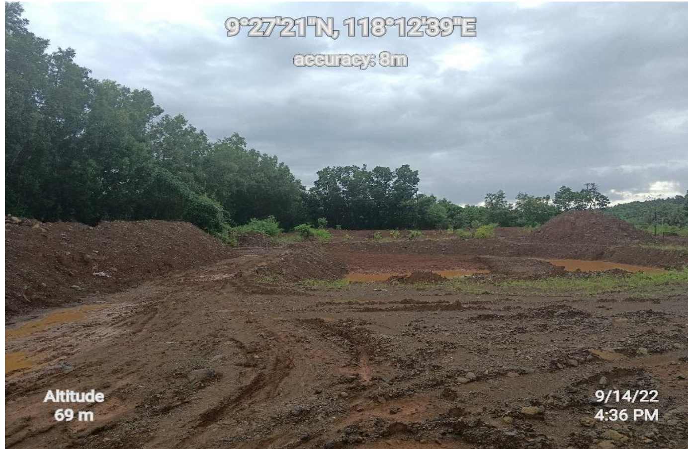
Photo 13. Dumping and drying area of desilted materials from siltations ponds.