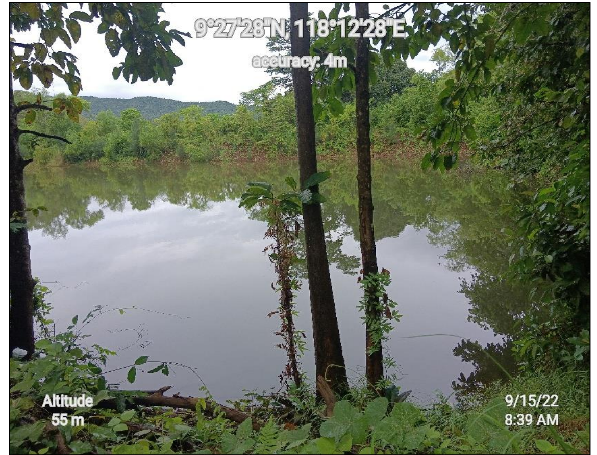
Photo 14. Series of siltation pond in Badlisan observed to be in good condition.