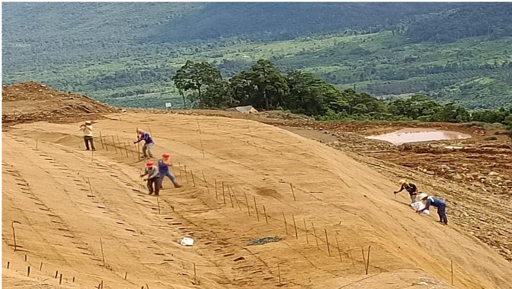
Photo(s) 6. On-going digging of planting holes observed at Rehabilitation Area 12