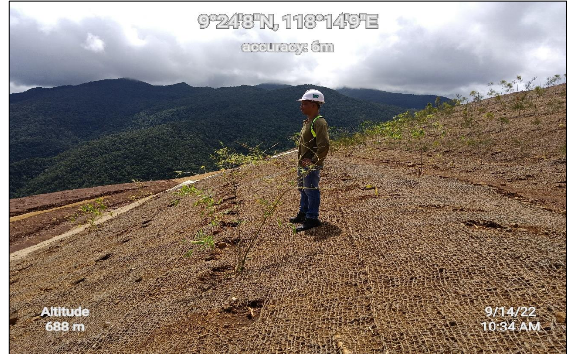
Photos 10 & 11. Bamboo Plantation at Area 12. Kawayan-Bayog (left) and Kawayan- Tinik (right)