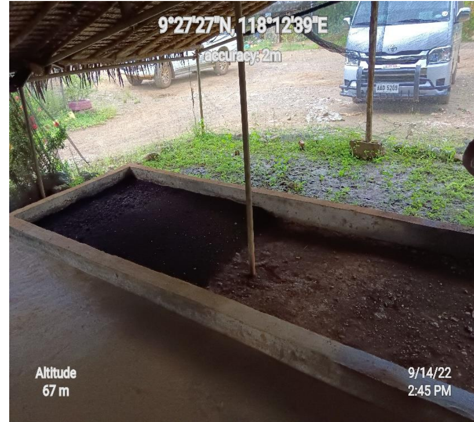
Photo 18 & 19. Production of vermin cast at BNC's nursery.