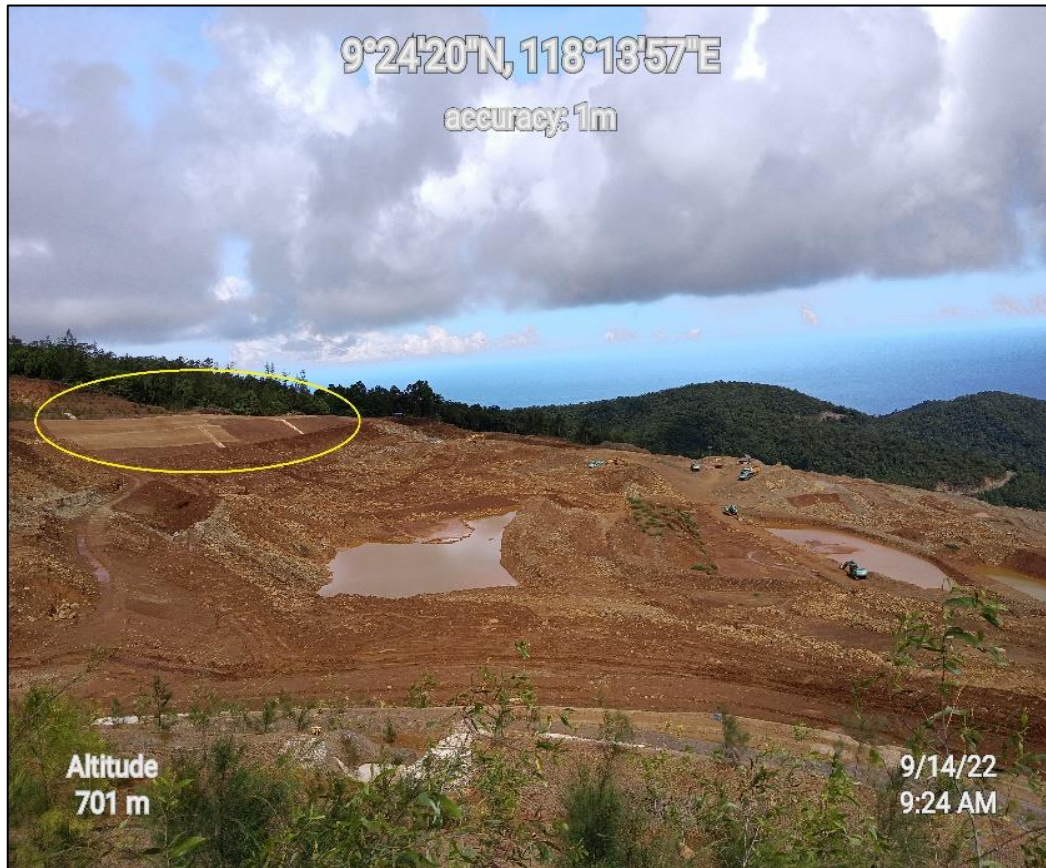
Photo 2. Areas 6 (encircled) and 7 scheduled for rehabilitation in 2022.