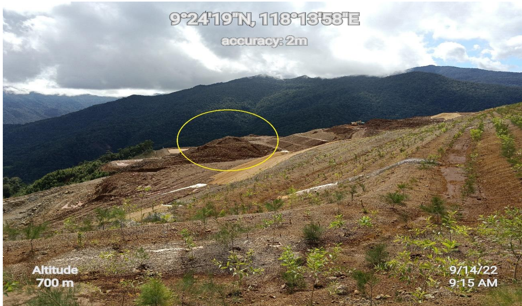
Photo 12. Stockpile of top soil and subsoil material in Area 20.