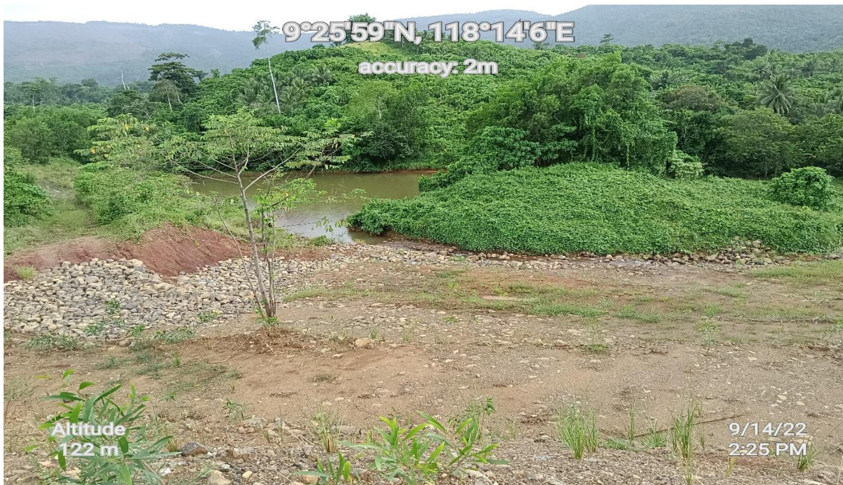
Photo 16. BSW1 siltation pond observed to be in good condition.