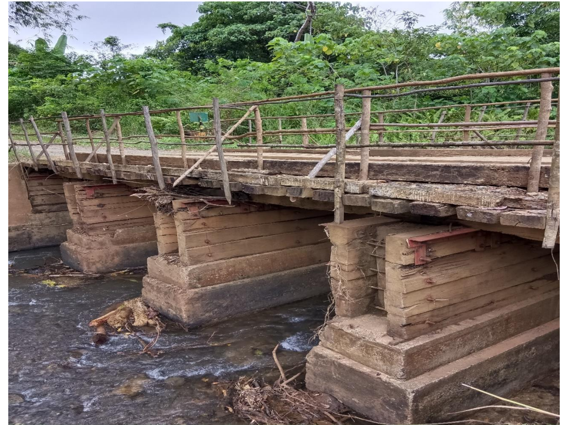
Photo 21. Barangay Berong is requesting for the reconstruction to improve of the Marangreg River Bridge.