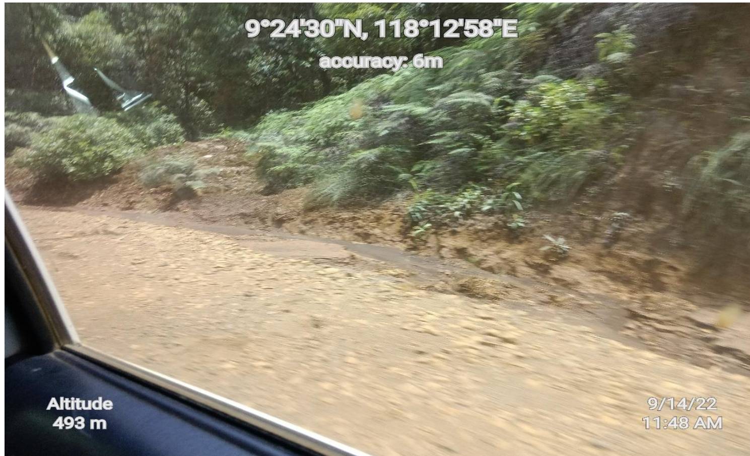
Photo 20. Observed accumulated silt at haul road drainage.