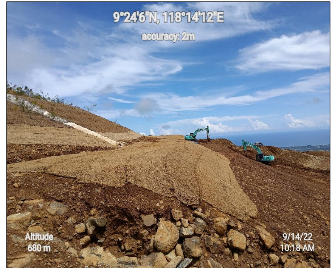
Photo 3. Ongoing Preparation of Area 11.