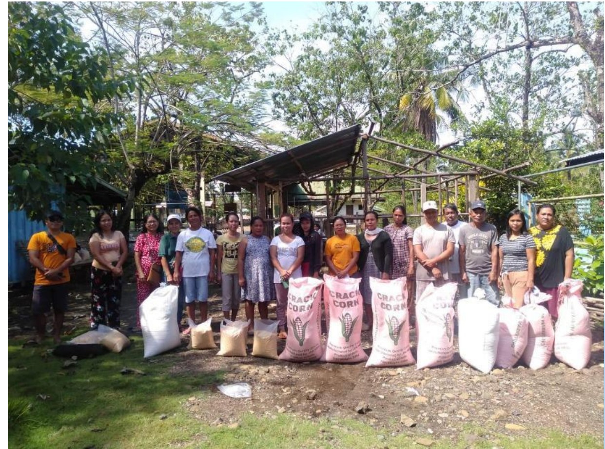
Provision of crack corn for the members of Manukan sa Bakuran project in Brgy. Berong