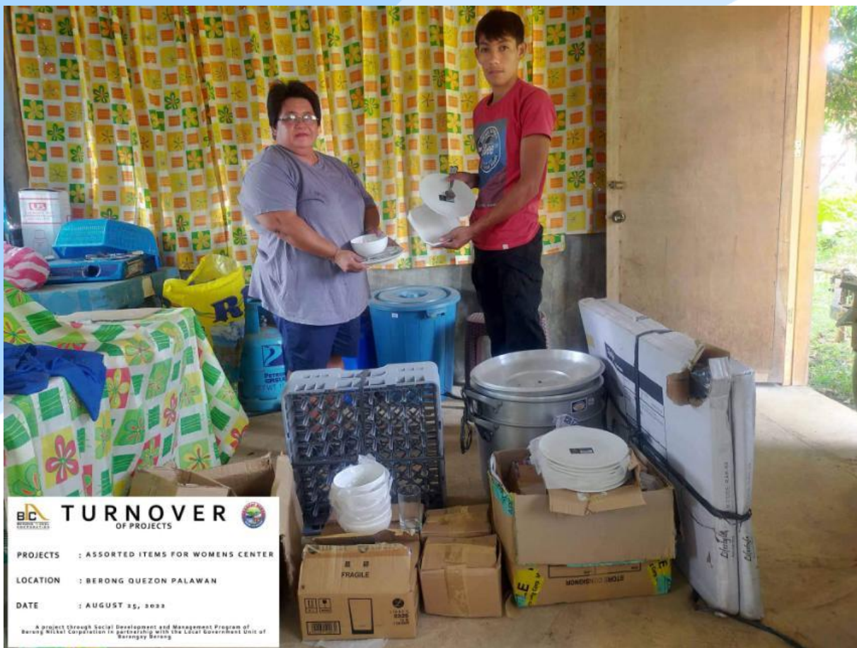
Provision of assorted rental materials as part of Women's Organization livelihood project