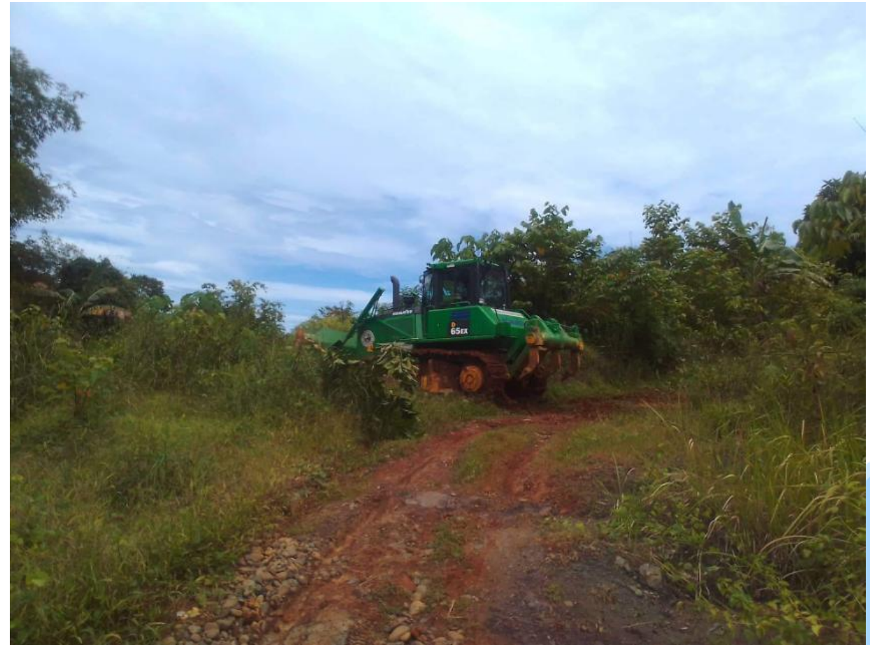
Provision of fuel for the road piloting of farm to market road at So. Catuayan