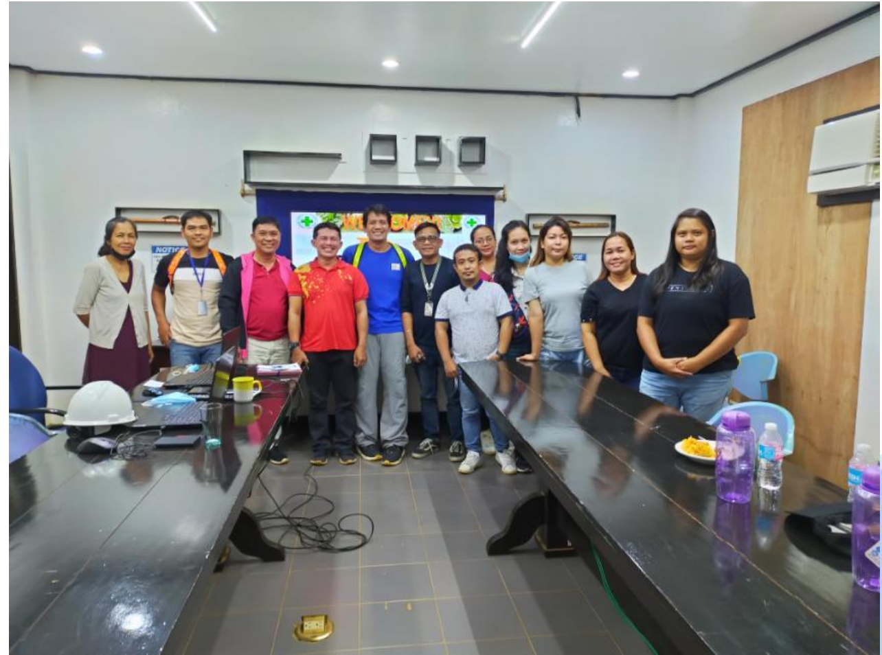
Lakbay Aral and site visit of media personnel from Palawan Media Association