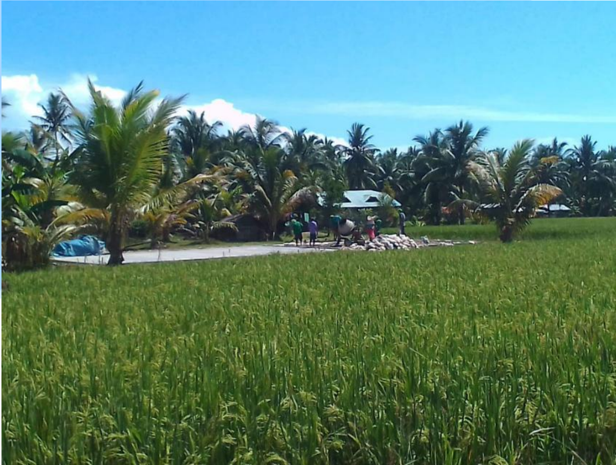
Constructed solar dryer for farmers in So. Labuan, Brgy Aramaywan