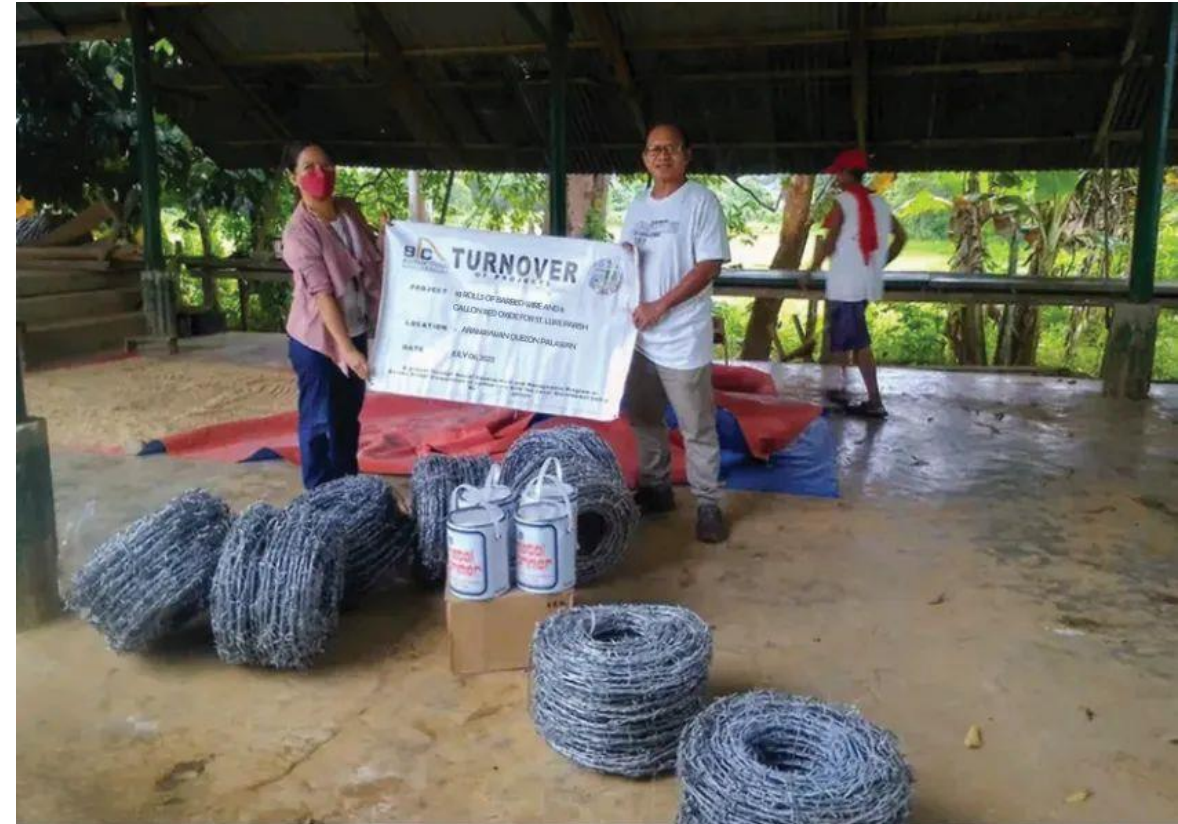
Provision of barbwire and paint materials to be used for the perimeter fence of Brgy. Aramaywan Parish church