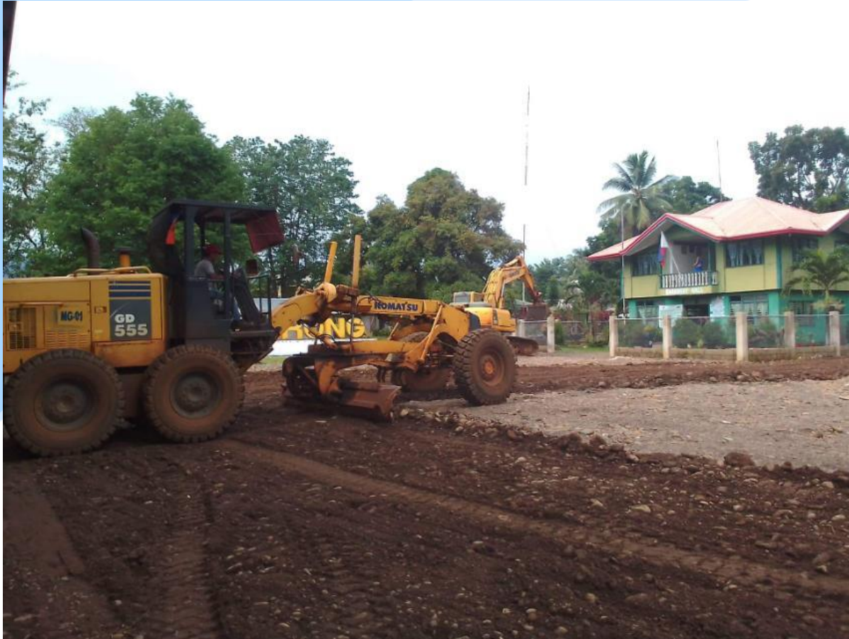
Provided equipment and fuel for road improvement in Bgry. Berong