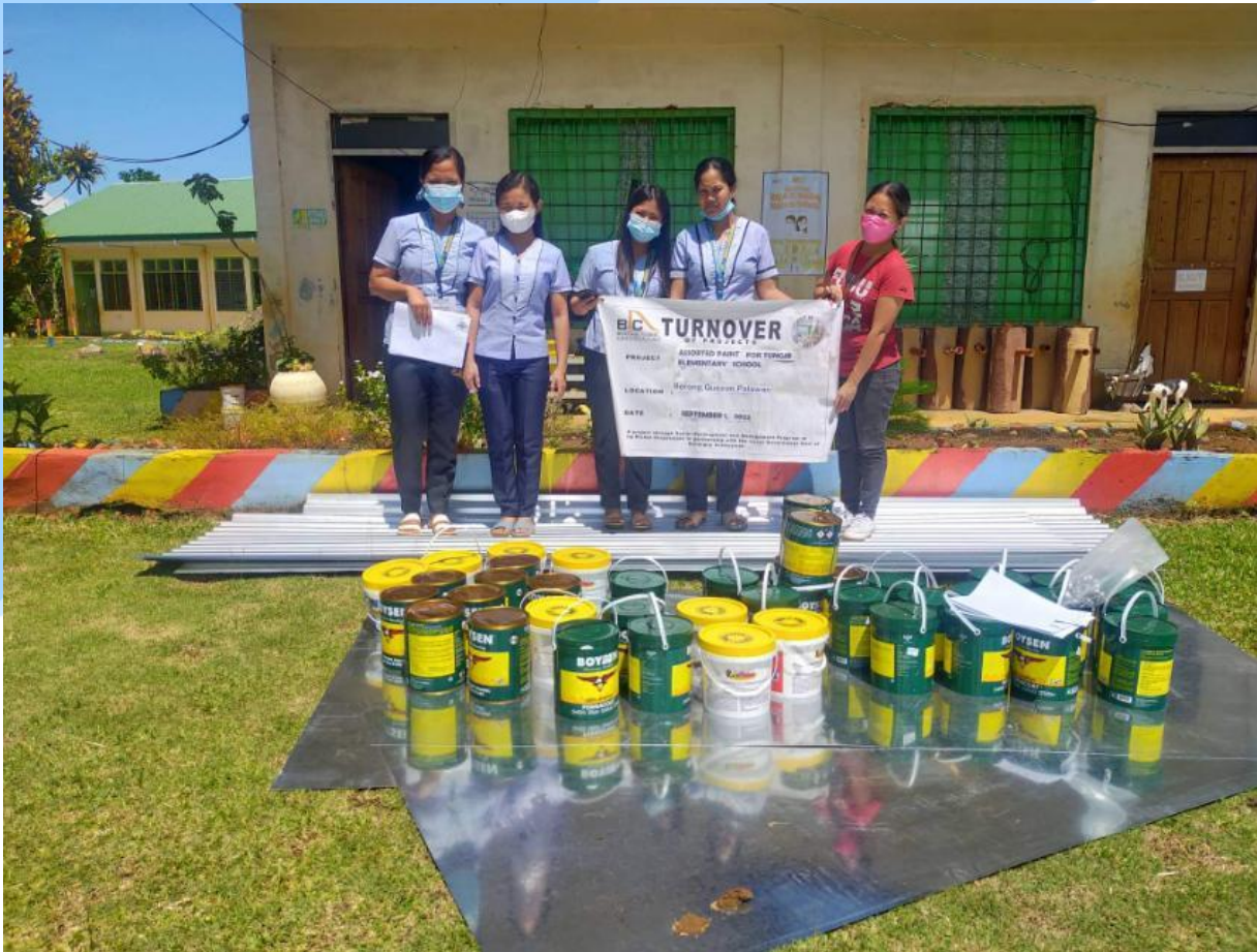
Provision of assorted paints and corrugated sheet for school beautification at Tungib Elementary School