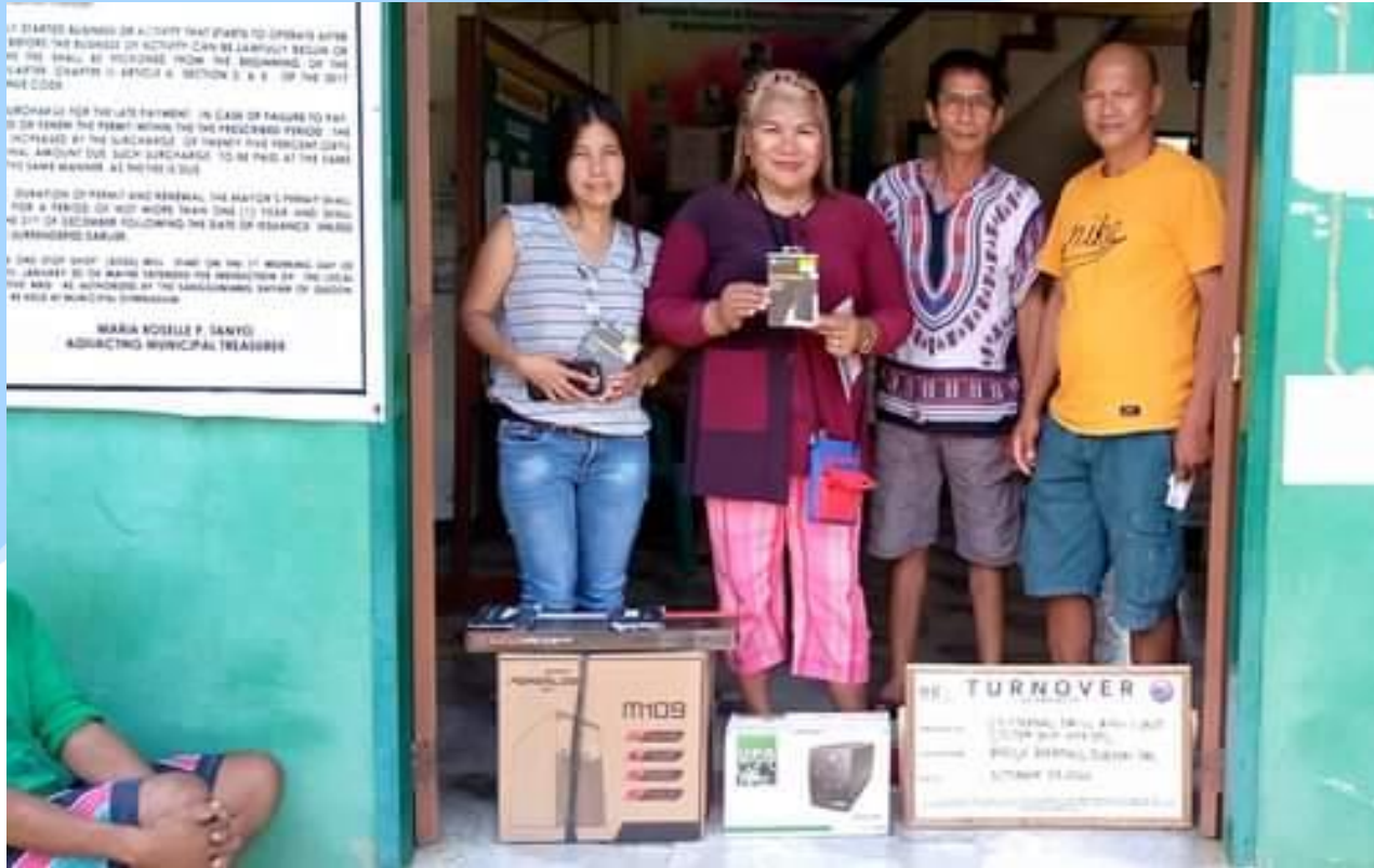
Provided set of desktop for barangay hall in Brgy. Berong