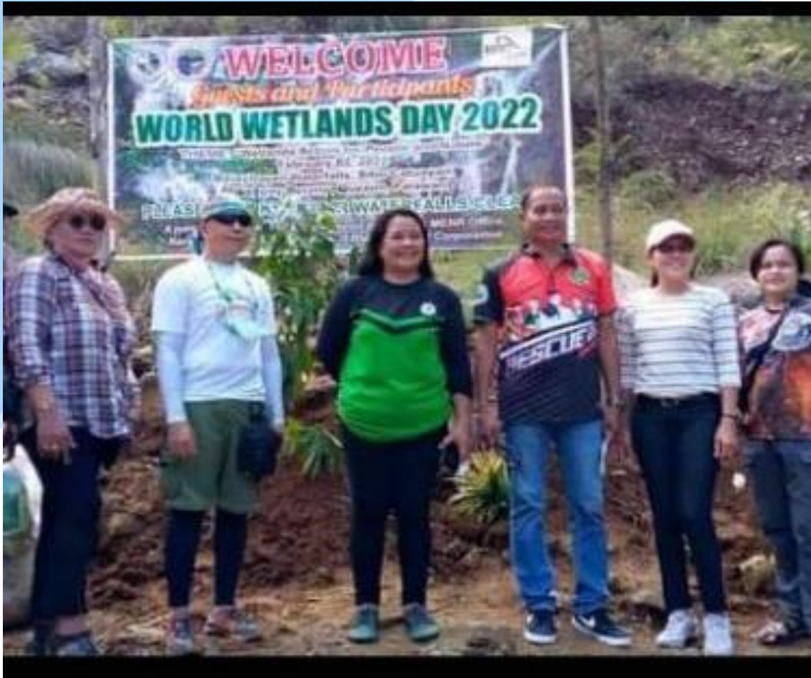
Participated in World Wetlands Day Celebration