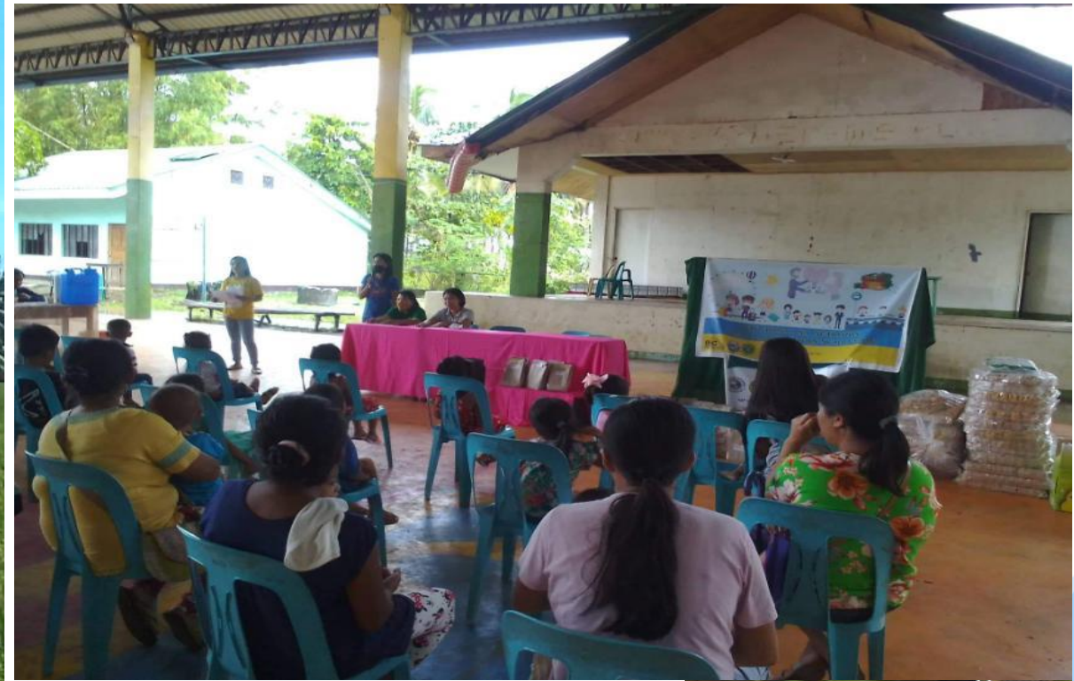
Assist and participate in Nutrition month celebration