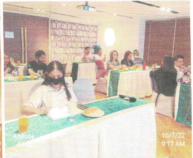
Photos during the levelling-off meeting on the updates of the SCS SAP Project Implementation and Validation of Accomplishments at Hue Hotels and Resorts on October 7, 2022