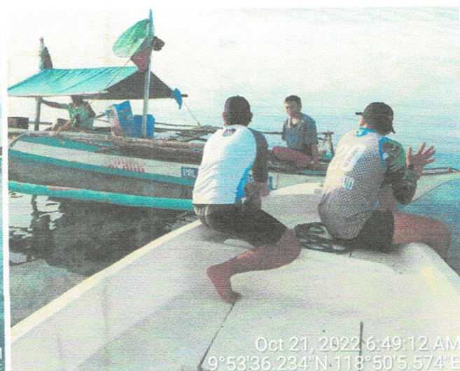
Photos during regular Seaborne Patrol within the vicinities of Snake Island NCMCR