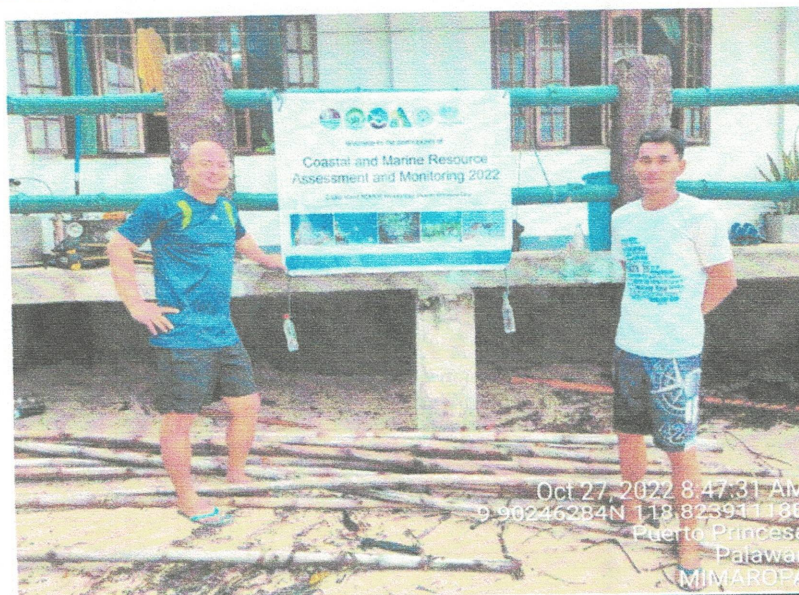
Photos of the composite team that conducted the Coastal Resource Assessment and Monitoring at Snake Island NCMCR on October 24-28, 2022