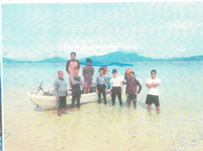
Photos during deployment of monitoring blocks on six (6) coral reef monitoring stations at Snake Island NCMCR with participation from PCSDS on October 11-14, 2022