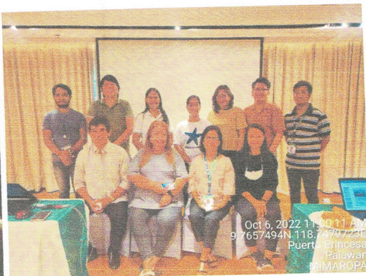
Photos during the updating meeting of Snake Island NCMCR Operational Plan 2023-2028 at PENRO Training Hall and Hue Hotels and Resorts on October 5-6, 2022