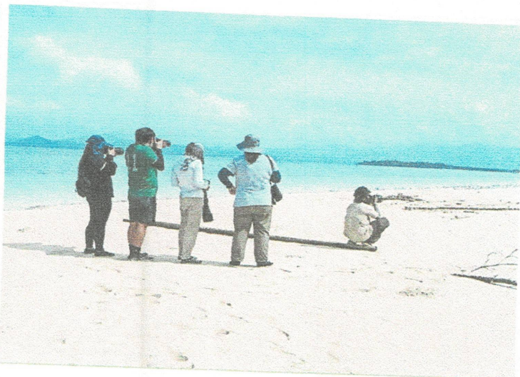
Photos during the waterbirds assessment and monitoring on October 25-26, 2022