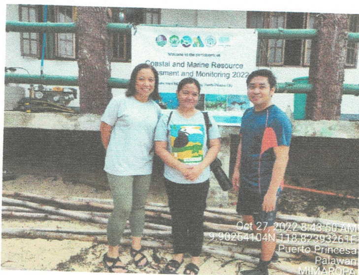
Waterbirds Monitoring Team composed of City ENRO, CENRO PPC, ERDB, BMB and PENRO personnel