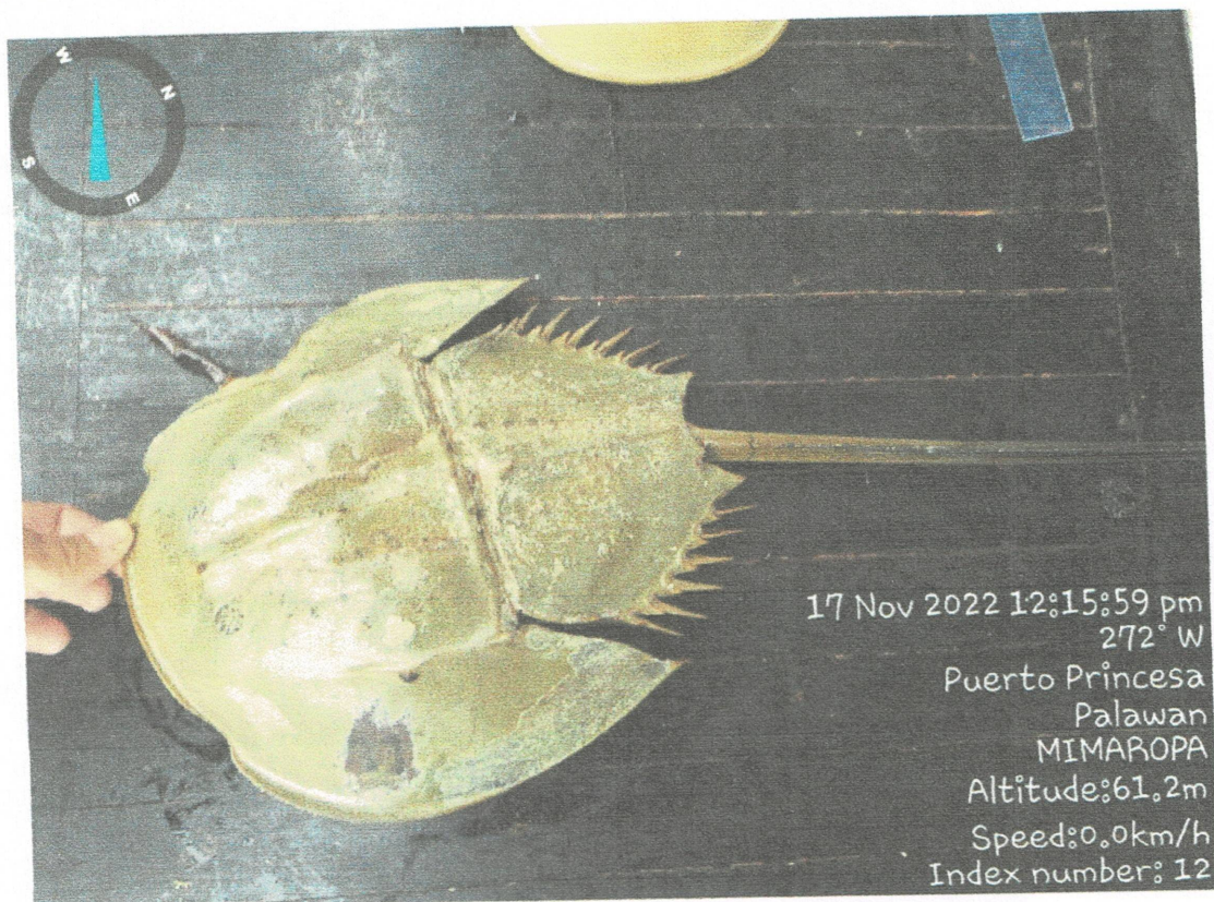
Photos of Horseshoe crab before releasing back to the sea